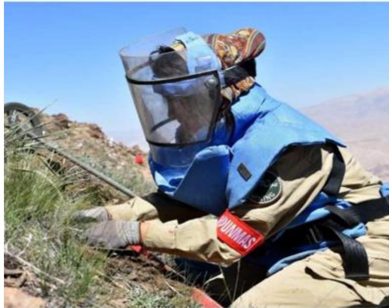
A Mine Action Specialist in Afghanistan.

Protecting People from Explosive Hazards in Humanitarian Emergencies: Promoting Inclusive, Local and Durable Solutions