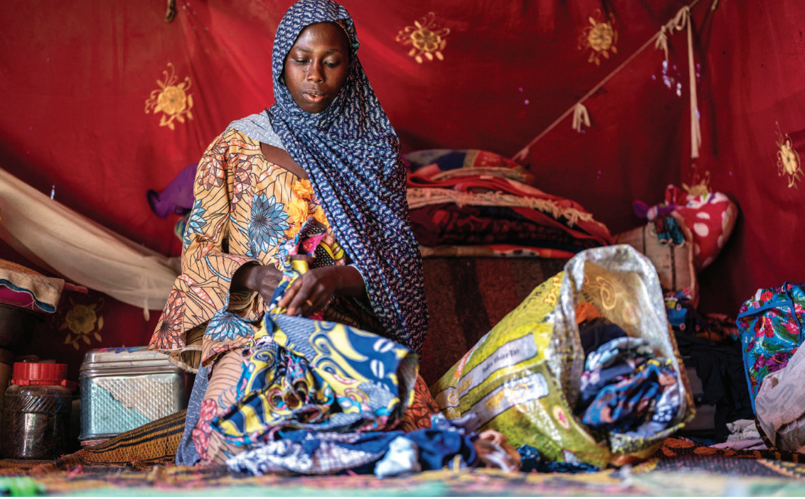
A 30-year-old Nigerian woman was forced to flee to Diffa in 2019, when heavy rains flooded her crop fields and house in Chitemari, Niger (2021).