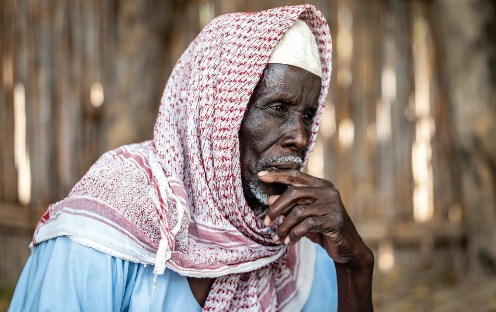
A Chadian farmer, 75, was forced to flee to Baga Sola in Lake Chad Province after Teteoua, his village, was attacked by Boko Haram militants in 2015 (2021).