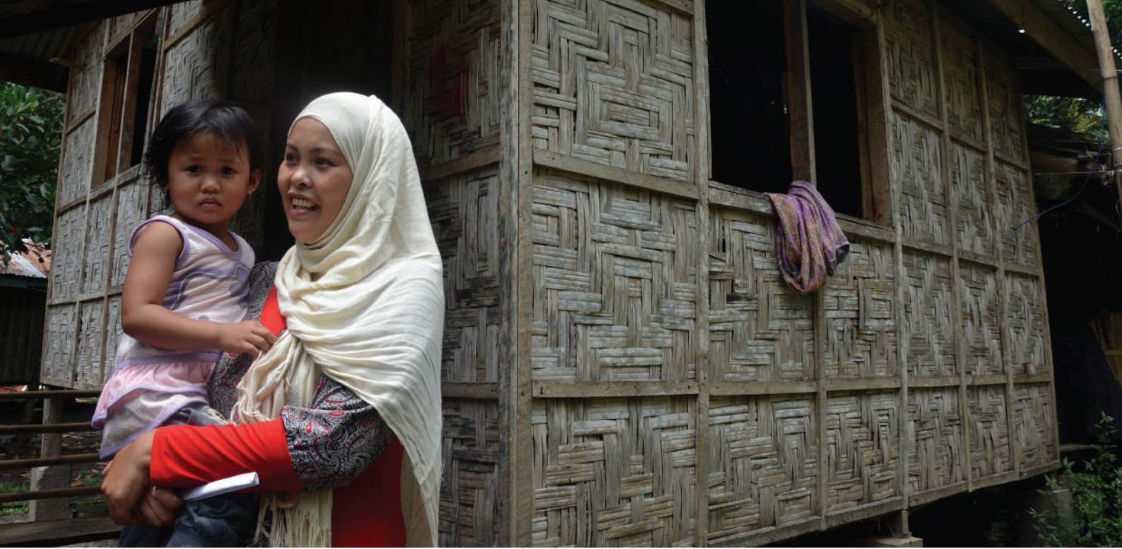
A displaced woman with her child in Madiya, Philippines (2017).