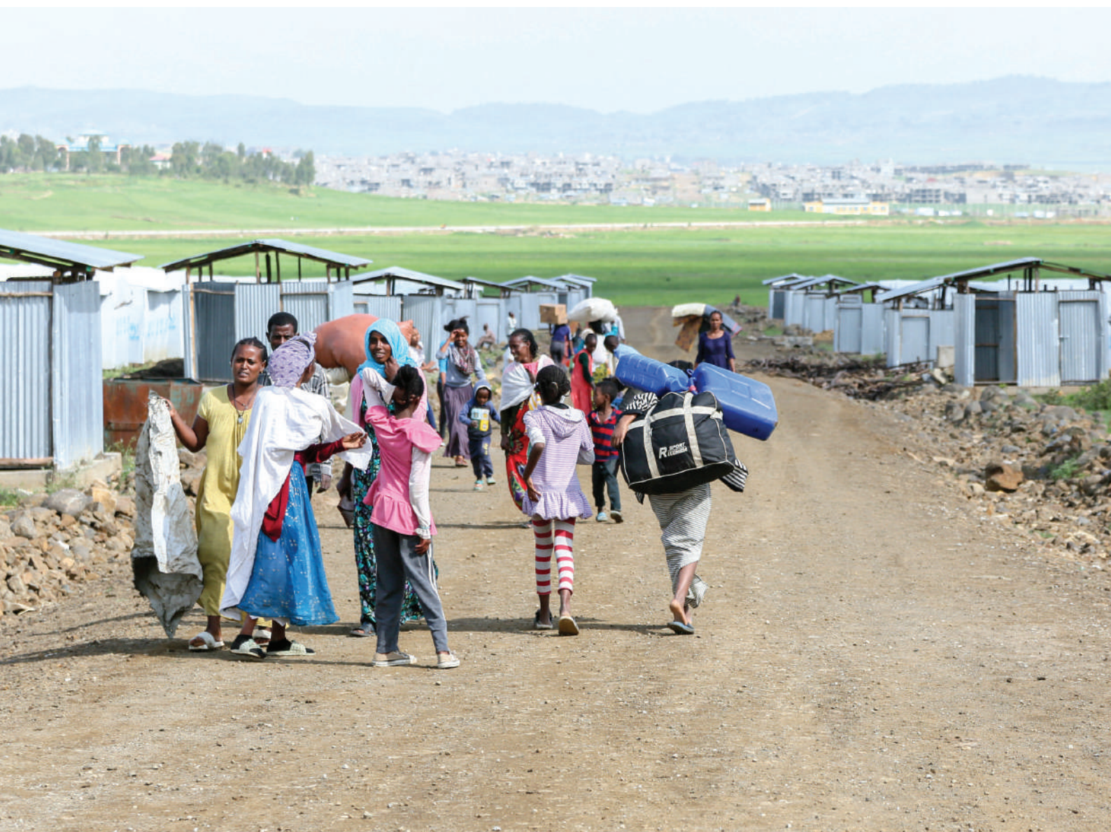
The relocation of internally displaced people to Sabacare 4, a new site constructed to shelter IDPs who cannot return home in Ethiopia (2019).

→ Watch this video to learn more about the project and ZHRC’s role: www.zhrc.org.zw/videos/ .