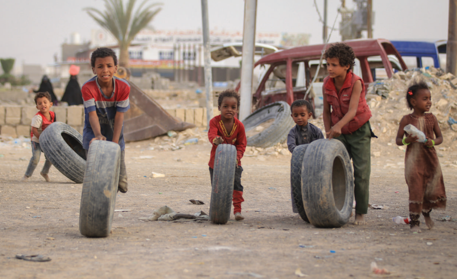
Displaced children play with tires in Al-Rawdah camp in Marib, Yemen (2021).