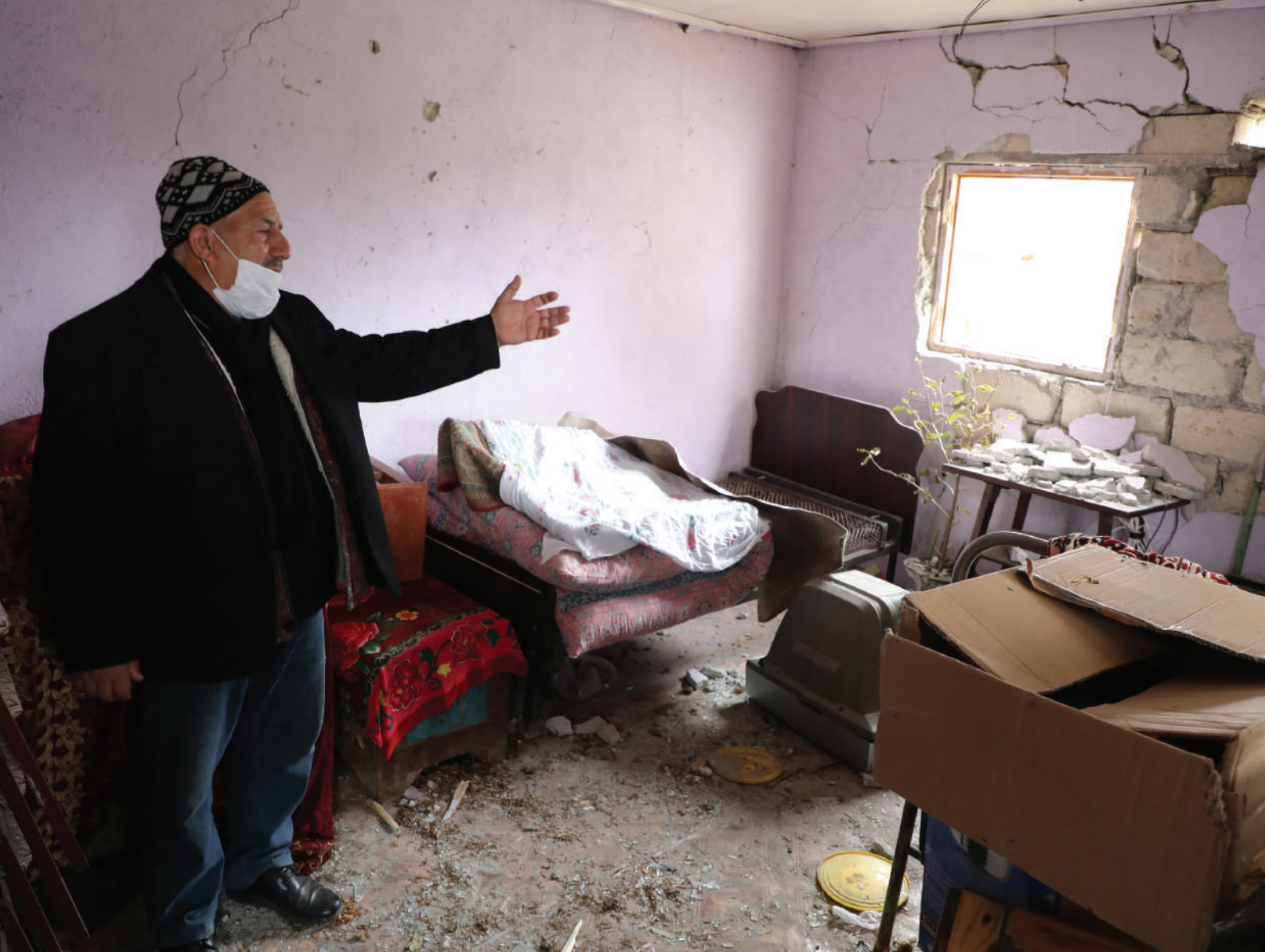
A 66-year-old internally displaced Azerbaijani man was displaced from Banovshalar settlement in the Agdam district, near the disputed territory of Nagorno-Karabakh (2020).