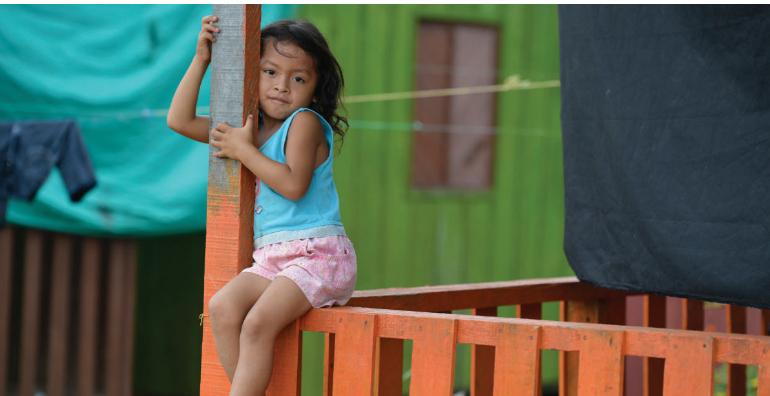
A five-year-old child plays outside her family home at a settlement for displaced people in Caqueta, Colombia (2013).