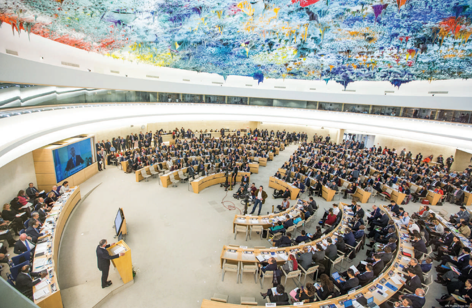
UN Human Rights Council.