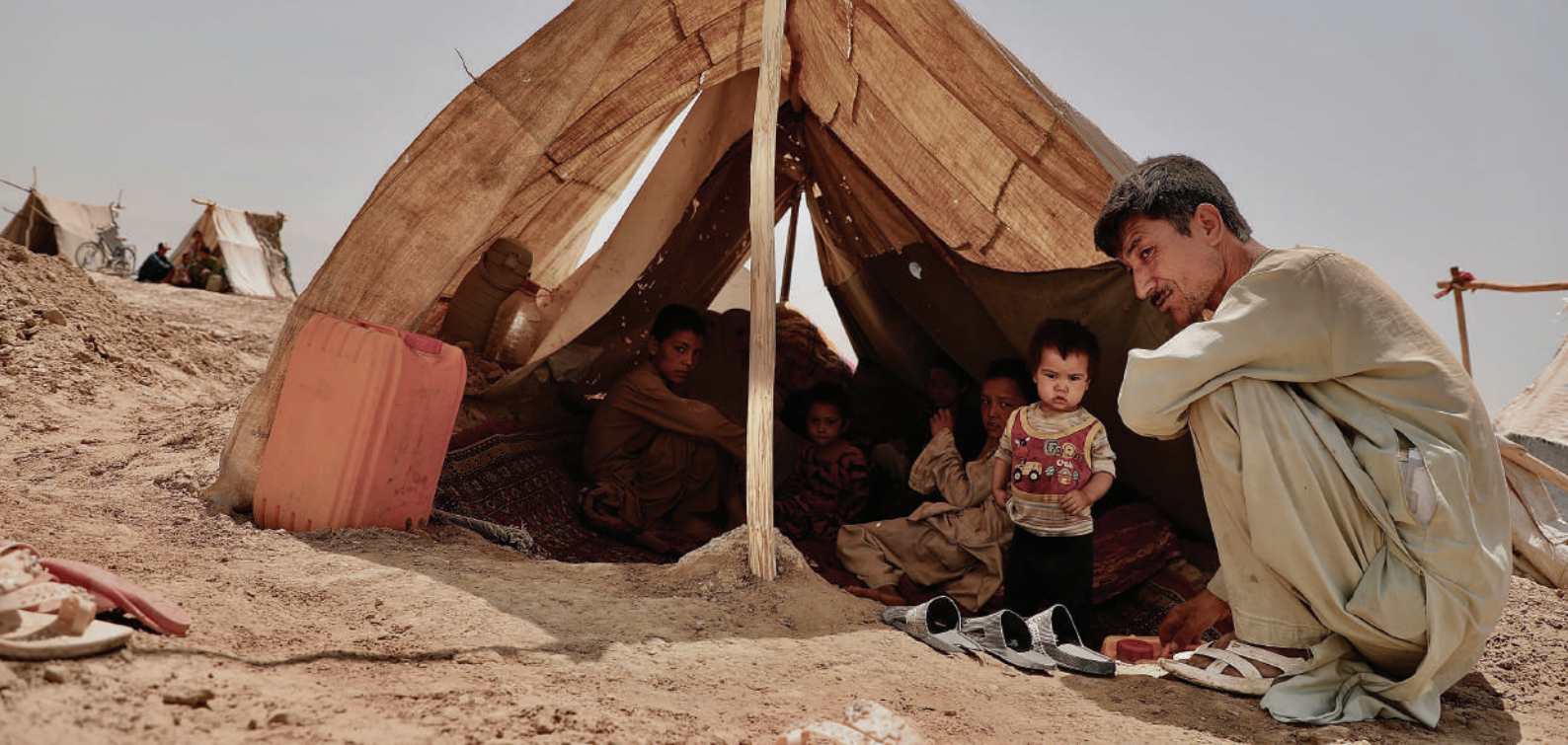
Families displaced by the conflict in Afghanistan are forced to live in makeshift tents in the Brigade settlement (2021).