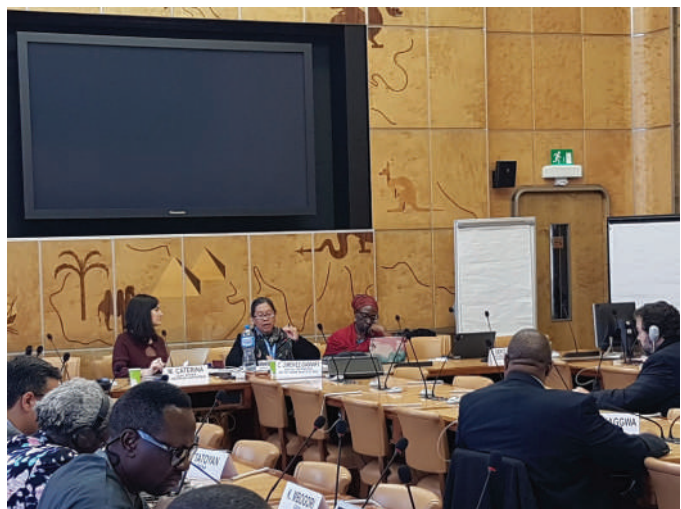
Special Rapporteur on the human rights of IDPs opening the 2018 roundtable with NHRIs

This handbook was developed during the COVID-19 pandemic, which has had a dramatic impact on the most vulnerable, among them many IDPs. Witnessing this impact has served as a harsh reminder of the importance of a human rights-based approach that prioritizes the respect, promotion, protection and fulfilment of the rights of all, particularly those in vulnerable situations. The fundamental role NHRIs can play has therefore never been clearer.