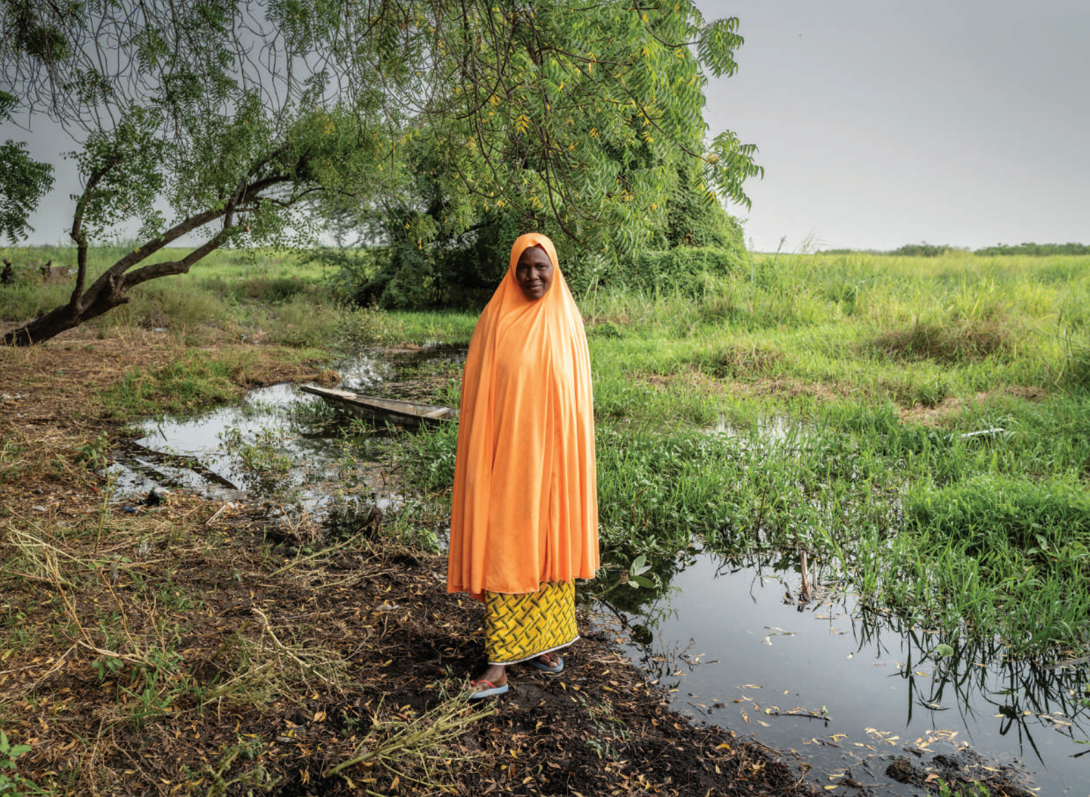
A Chadian woman, 40, was forced to flee to Baga Sola in Lake Chad Province after Teteoua, her village, was attacked by Boko Haram militants in 2015 (2021).