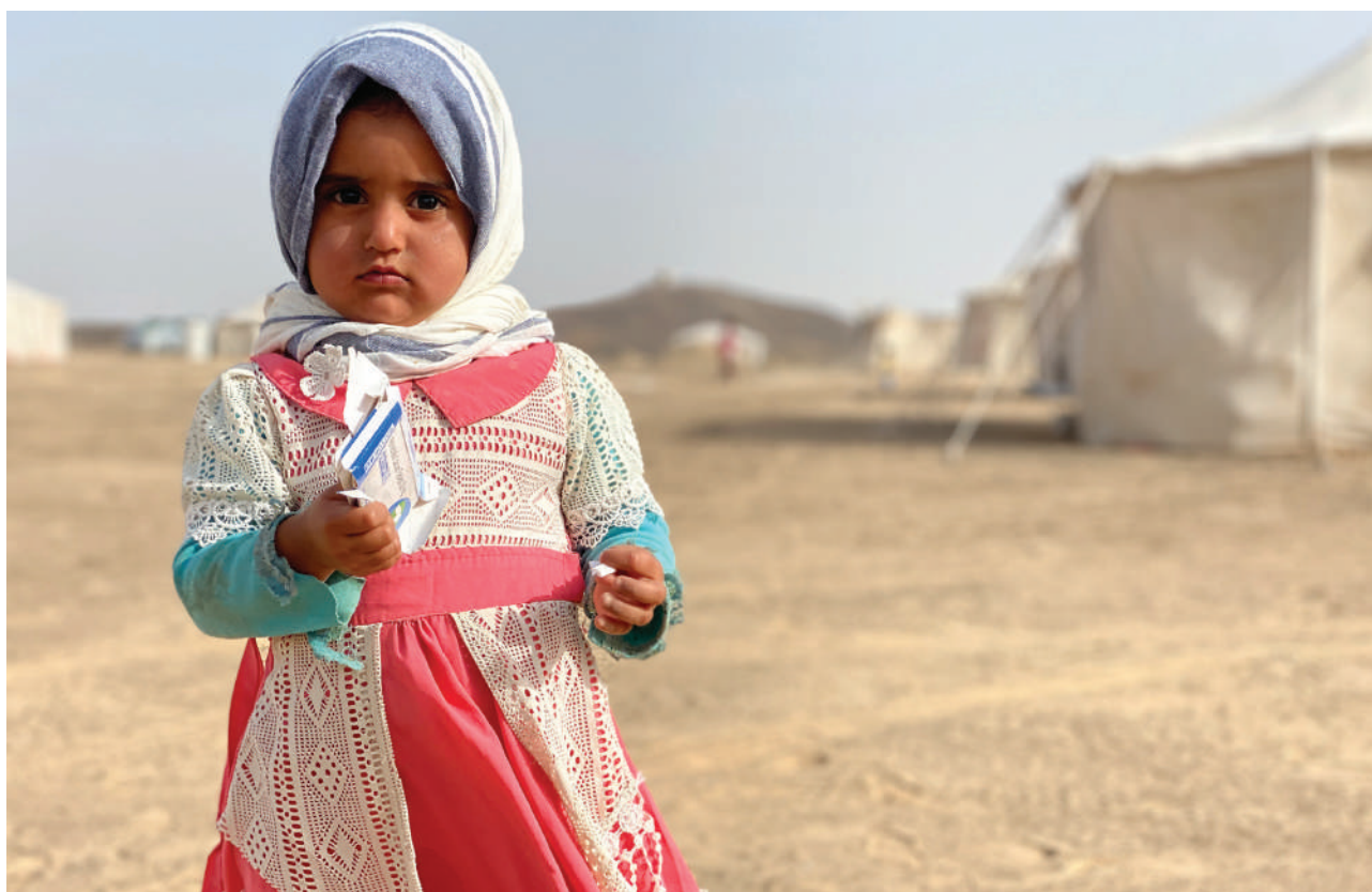
A two-year-old Yemeni girl, displaced by conflict in Al Jawf, at the hosting site for IDPs in Marib, Yemen (2020).

In 2019, the Commission organized a "mobile service provision day" in collaboration with relevant government authorities, with the aim of facilitating face-to-face interactions between the communities and service providers. The Commission used handbills and media outlets to announce the event. Among the public institutions invited were the Divisional Secretary, women development officers, land officers, probation officers, the registrar, the police, health officers, labour officers, legal aid officers and fisheries. The occasion provided an opportunity for the authorities to identify and undertake immediate-, medium- and long-term actions to address the protracted issues faced by IDPs and returnees, which the Human Rights Commission continued to monitor.