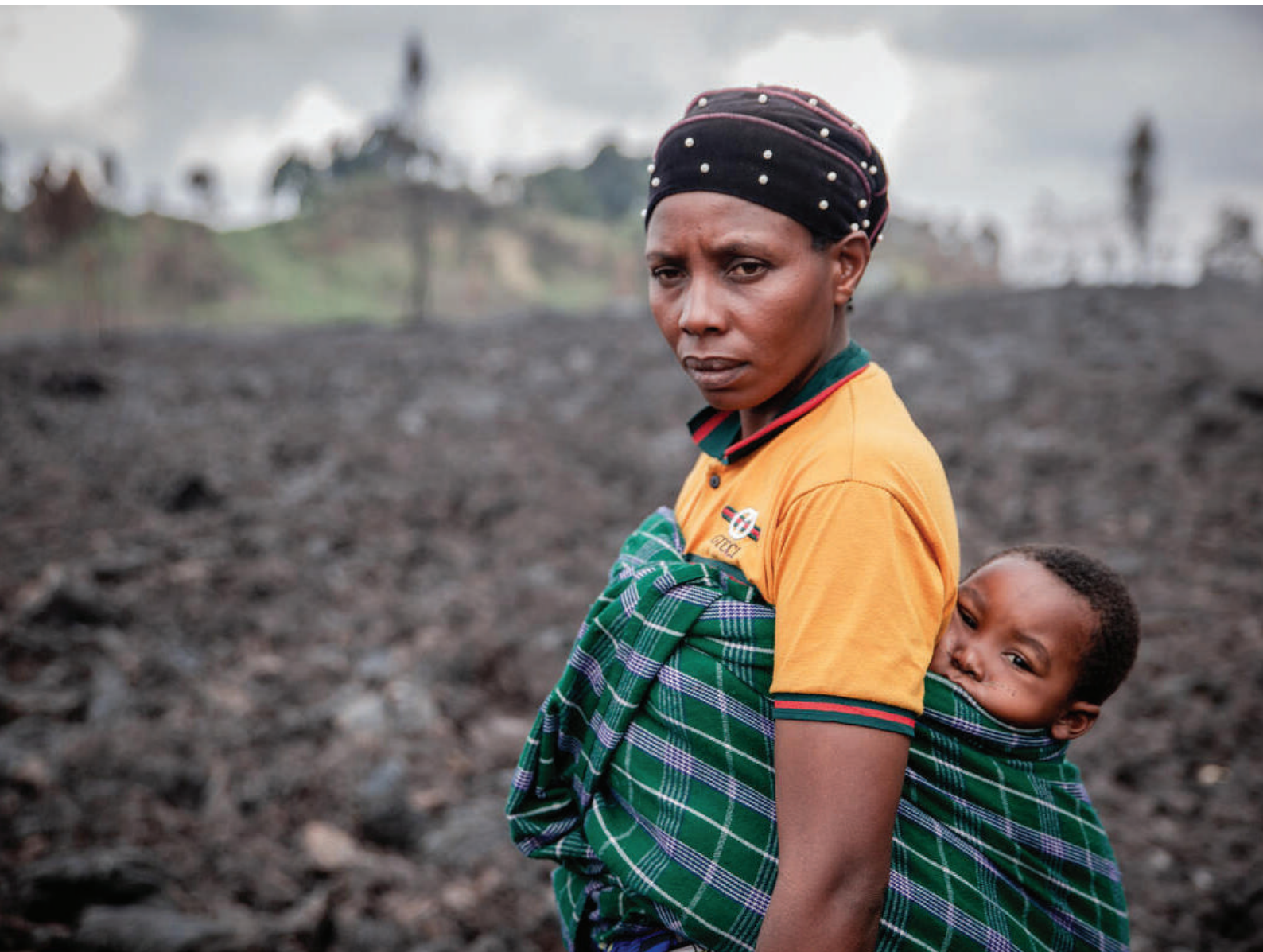
Democratic Republic of Congo: more than 350,000 people were displaced by eruption of the Nyiragongo volcano in Goma. Here an IDP woman, aged 40, visits the spot where their house once stood with one of her 7 children (June 2021).

The Commission has been resolute in continuing to advocate for not just the full implementation of the Decision for the benefit of the Endorois but also for comprehensive legal, policy and institutional reforms to protect the rights of local communities and indigenous people in similar circumstances. This example is illustrative of the need for collaborative, sustained and multi-pronged strategic efforts by communities, civil society and NHRIs to promote and protect the rights of vulnerable citizens, particularly against forced evictions.