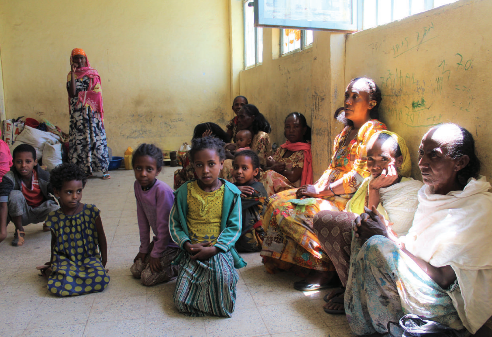
In Ethiopia's Tigray region, the conflict has displaced hundreds of thousands of people, who sought shelter in communal sites such as school campuses in the larger cities in the region, Mekelle and Shire (2021).