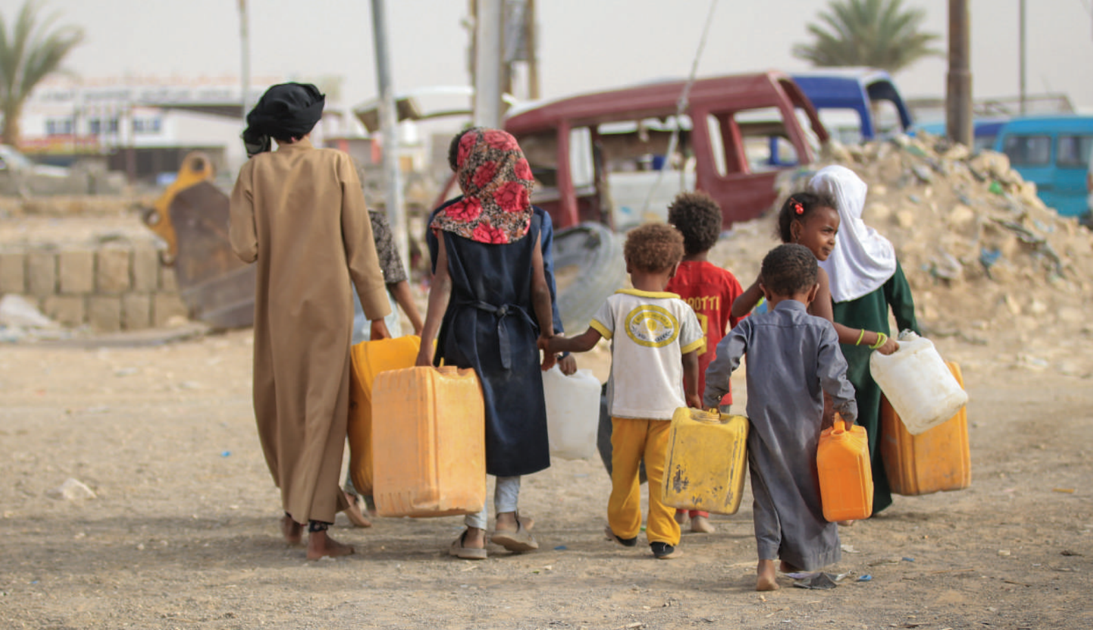
Displaced children going to fill water from the water distribution point in Al-Rawdah camp in Marib, Yemen (2021).