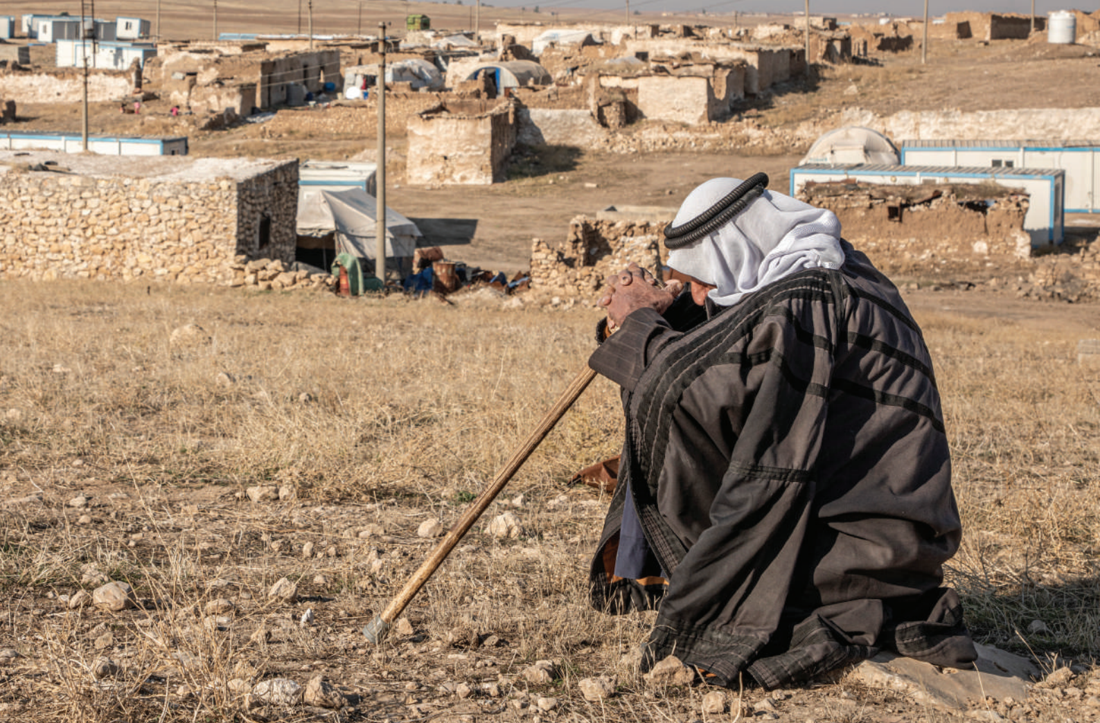
An elderly returnee sits near his destroyed home in a remote village in Nineveh, northern Iraq (2020).