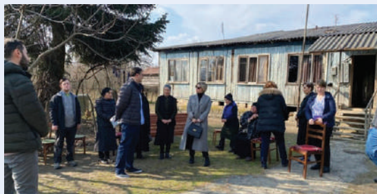
Public Defender visit to IDPs in Shamgona Village

The Georgian PDO, established in 1996, has developed a strong expertise in promoting and protecting the human rights of IDPs from conflict-affected areas. It receives and investigates large numbers of complaints related to internal displacement. Regional representatives of the Georgian PDO actively monitor the situation with respect to IDPs in the former IDP settlements and provide legal assistance to them. PDO representatives provide information about the challenges identified during the visits within the scope of their competence and cooperate with the local government to address these challenges. The Georgian PDO also dedicates a specific chapter of its annual parliamentary report to IDP rights.