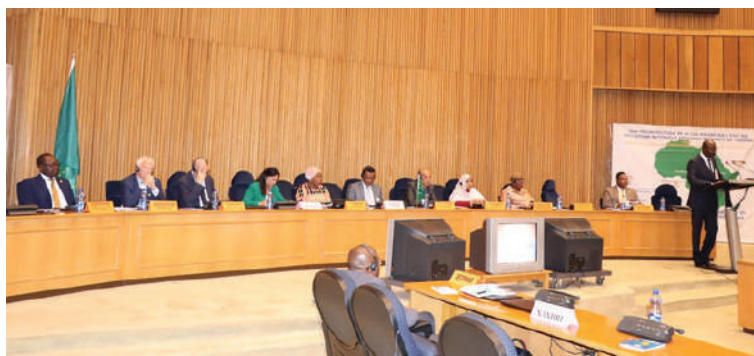
Opening session of the AUC-NANHRI Policy Forum on the state of African Human Rights Institutions, 5 September 2019.

As part of this cooperation, the two institutions worked with OHCHR and UNDP to organize the third Policy Forum on the State of Human Rights in Africa in 2019, which focused on durable solutions to forced displacement. This was in line with the African Union (AU)'s 2019 theme: “Refugees, Returnees and Internally Displaced Persons: Towards Durable Solutions to Forced Displacement in Africa” . At this forum, stakeholders developed and adopted a continental action plan on the contribution of NHRIs to durable solutions on forced displacements in Africa, with a strong focus on the promotion of the Kampala Convention. 69