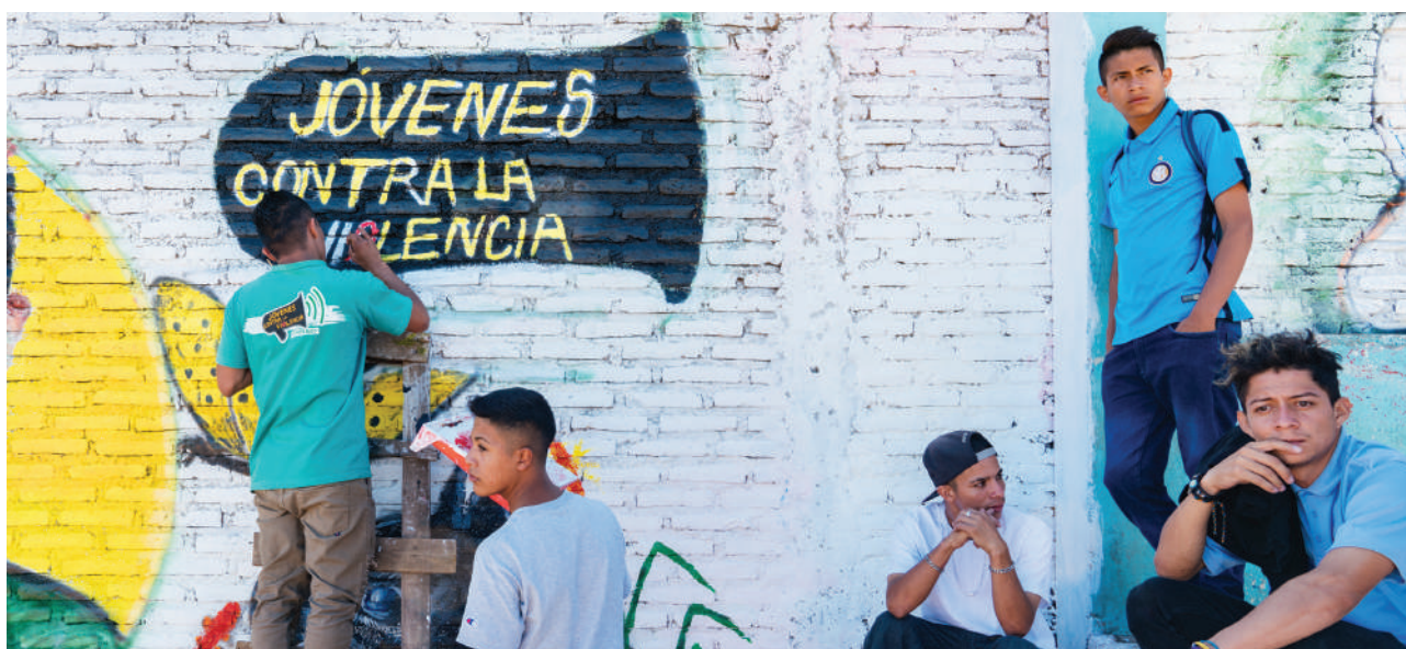
Leaders and volunteers of the organization ‘Youth Against Violence’ in Colonia Nueva Capital, Tegucigalpa, Honduras. The organization works throughout the country to empower youth through peace-building activities. Its founder and director, along with his family, are IDPs.