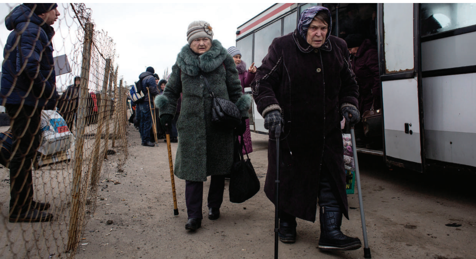
Residents in eastern Ukraine cross the border checkpoint between the government-controlled area and non-government controlled area in Mayorsk, Donetsk (2018).

According to the Ombudsperson, a more predictable and concrete way to protect the rights of IDPs and other affected citizens required legislative changes and consequently, they supported the proposal of a new law, entitled “On amendments to certain laws of Ukraine concerning the exercise of the right to a pension” (no. 2083-d of 26 November 2019) to regulate pension payments to IDPs and persons living in the temporarily occupied territories of Ukraine.