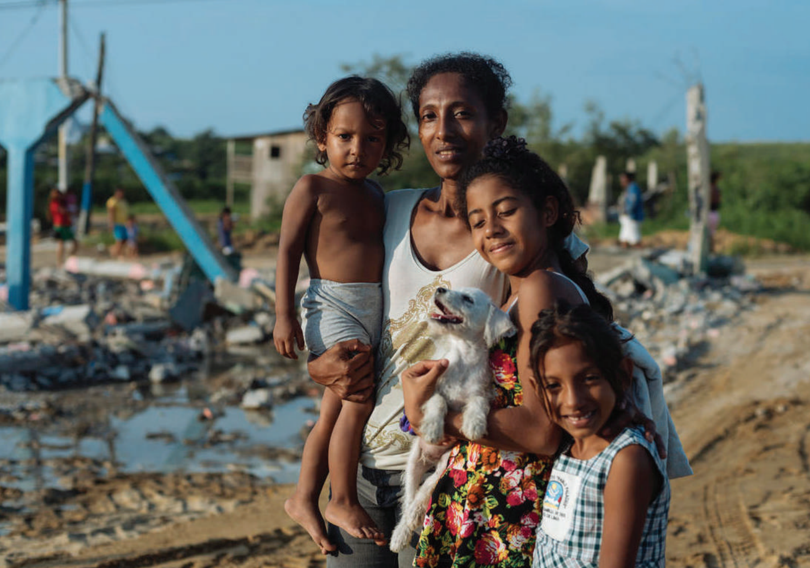
An Ecuadorian woman and her children were left homeless after the earthquake destroyed 90% of the houses in Chamanga, Ecuador (2016).