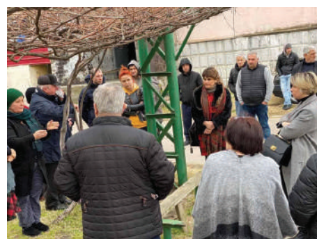
Public Defender meeting with IDPs living in Poti in February 2020.

For example in Georgia , in 2013, the Public Defender's Office (PDO) and several CSOs and international organizations conducted joint monitoring work to assess the human rights compliance of a countrywide renewed registration process for IDPs carried out by the State. The monitoring allowed the NHRI to gather detailed information on IDPs' situations, identify gaps in legislation and practice, and advise State bodies on actions required. The PDO has also developed strong monitoring systems on the housing situation of IDPs, providing regular recommendations through annual and special reports to State bodies on hazardous accommodation, and advising decision makers on IDPs' relocation as part of the durable housing solutions programme. 47