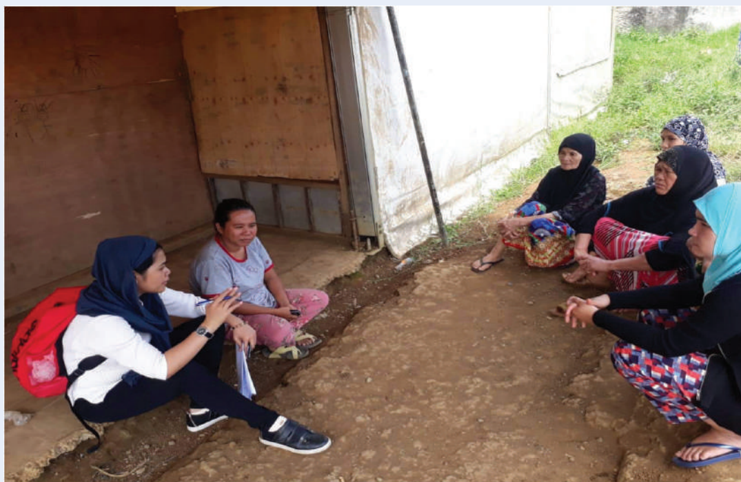
Interview with IDP women leaders in an evacuation site in Marawi City, May 2019

In the Philippines , the Commission on Human Rights established a Regional Office based in the conflict-affected Autonomous Region in Muslim Mindanao (ARMM). The CHR-ARMM Regional Office was a good example of how the decentralization of IDP-related functions, such as IDP monitoring, can be particularly useful in instances where a region of the country merits more intensive IDP protection work than others.