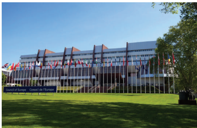
Palais de l'Europe.

Furthermore, while endorsing the Guiding Principles, the CoE Committee of Ministers has recognized that IDPs “have specific needs by virtue of their displacement” and has developed a set of 13 principles to guide member States “when formulating their internal legislation and practice” to ensure they effectively address internal displacement. 94 Similarly, in a recent recommendation – although not specifically on IDPs – the Committee of Ministers emphasized the “great potential and impact of independent NHRIs for the promotion and protection of human rights in Europe,” and made a series of recommendations on establishing and strengthening NHRIs while securing and expanding a safe and enabling environment, as well as promoting cooperation and support for NHRIs. 95 In the same vein, the Parliamentary Assembly of the CoE (PACE) has adopted various recommendations and resolutions highlighting, inter alia, the need for “continued international assistance to IDPs” and the important role that NHRIs can play in monitoring and protecting IDPs’ rights. 96