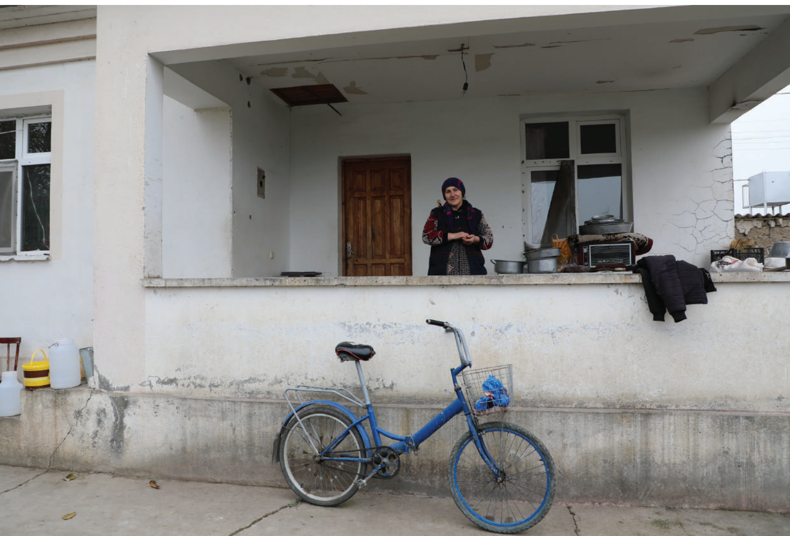
A 51-year-old internally displaced Azerbaijani woman was displaced from Dordyol 1 settlement in the Agdam district, near the disputed territory of Nagorno-Karabakh (2020).

Working with inadequate or inconsistent funding are commonly cited obstacles to the work of NHRIs, hindering their capacity to address the human rights of IDPs. To the extent that it is relevant and feasible, NHRIs' core budget should include specific funding for activities on internal displacement to enable them to address internal displacement through their core and long-term activities, rather than temporary, project-based or one-off funds. While governments should legally ensure adequate funding and guarantee their ability to work independently, NHRIs must often expand their operations using existing resources, with obvious consequences. The institutions' ability to receive external funding, in line with the Paris Principles, 34 is of particular importance, as is the need to work with donors to enhance their understanding of the critical role and value of NHRIs in this area.