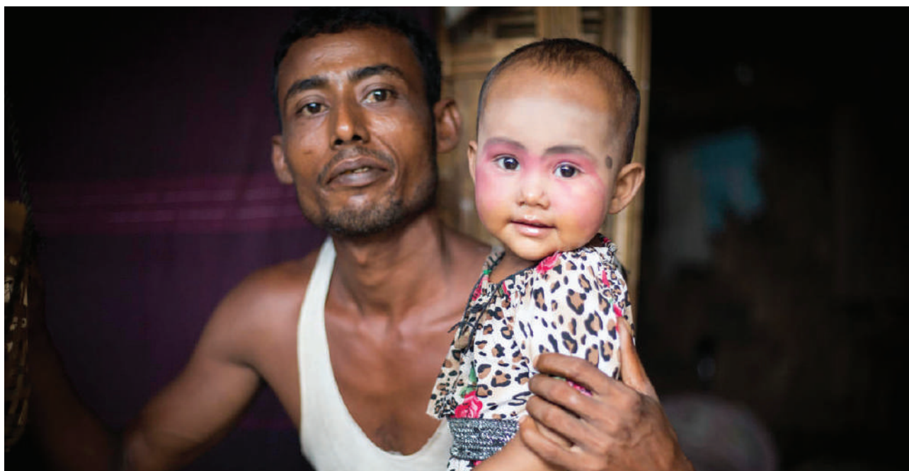
A displaced Rohingya father and his child at Dar Paing camp for internally displaced people in Sittwe, Rakhine state, Myanmar (2017).