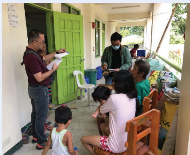
Interviews with IDP families affected by the Taal Volcano eruption in an evacuation site in Balayan, Batangas, February 2020

The Philippines is a country affected by recurrent internal displacement due to a variety of causes, including disasters resulting from natural hazards, conflict and large-scale development projects. In this context, the Commission on Human Rights of the Philippines (CHRP), which has a broad mandate for the protection and promotion of human rights, 49 has worked closely with UNHCR to address internal displacement, particularly through the establishment of a joint IDP project. A concrete result of this project was the development of an “IDP displacement monitoring tool” and accompanying User’s Guide 50 and Interview Guide to support field staff in their data gathering and analysis. The target users of the tool are CHRP’s staff and partners joining monitoring missions to ascertain the conditions of IDPs on the ground.