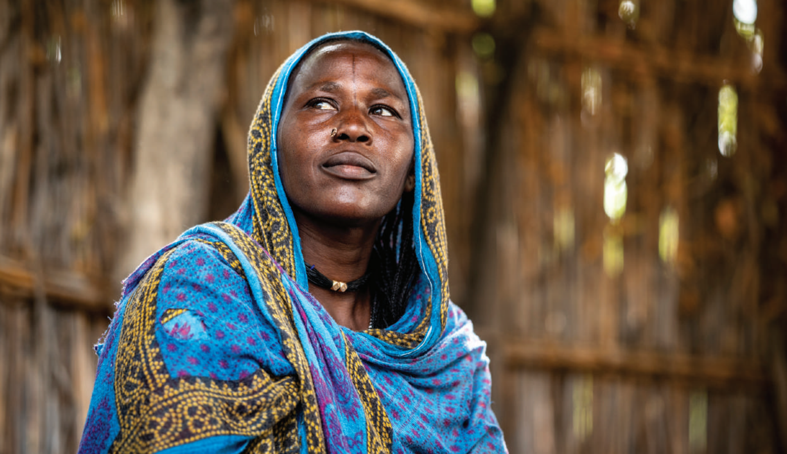
A Chadian woman, 40, was forced to flee to Baga Sola in Lake Chad Province after Teteoua, her village, was attacked by Boko Haram militants in 2015 (2021).