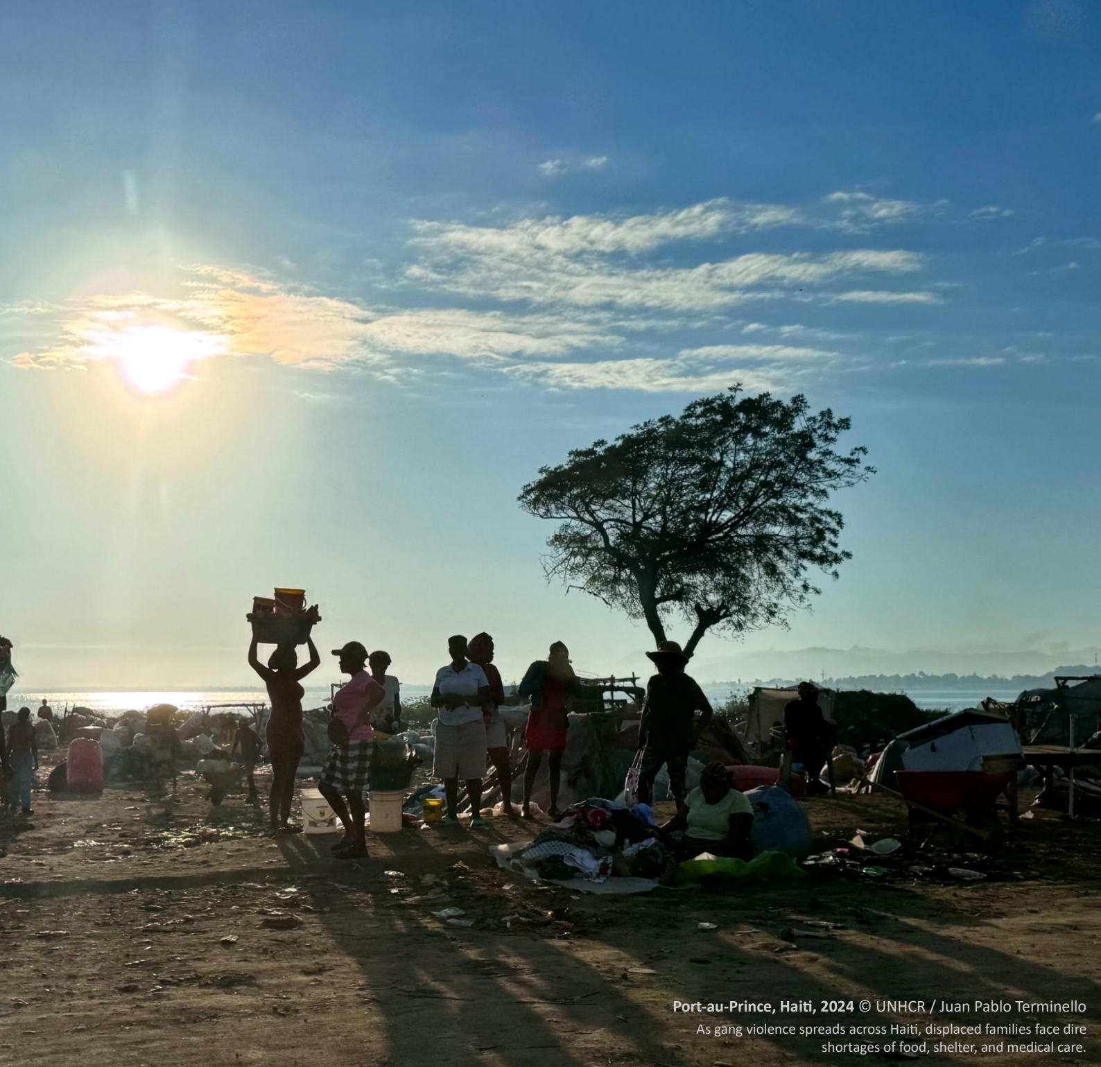
Port-au-Prince, Haiti, 2024 As gang violence spreads across Haiti, displaced families face dire shortages of food, shelter, and medical care.