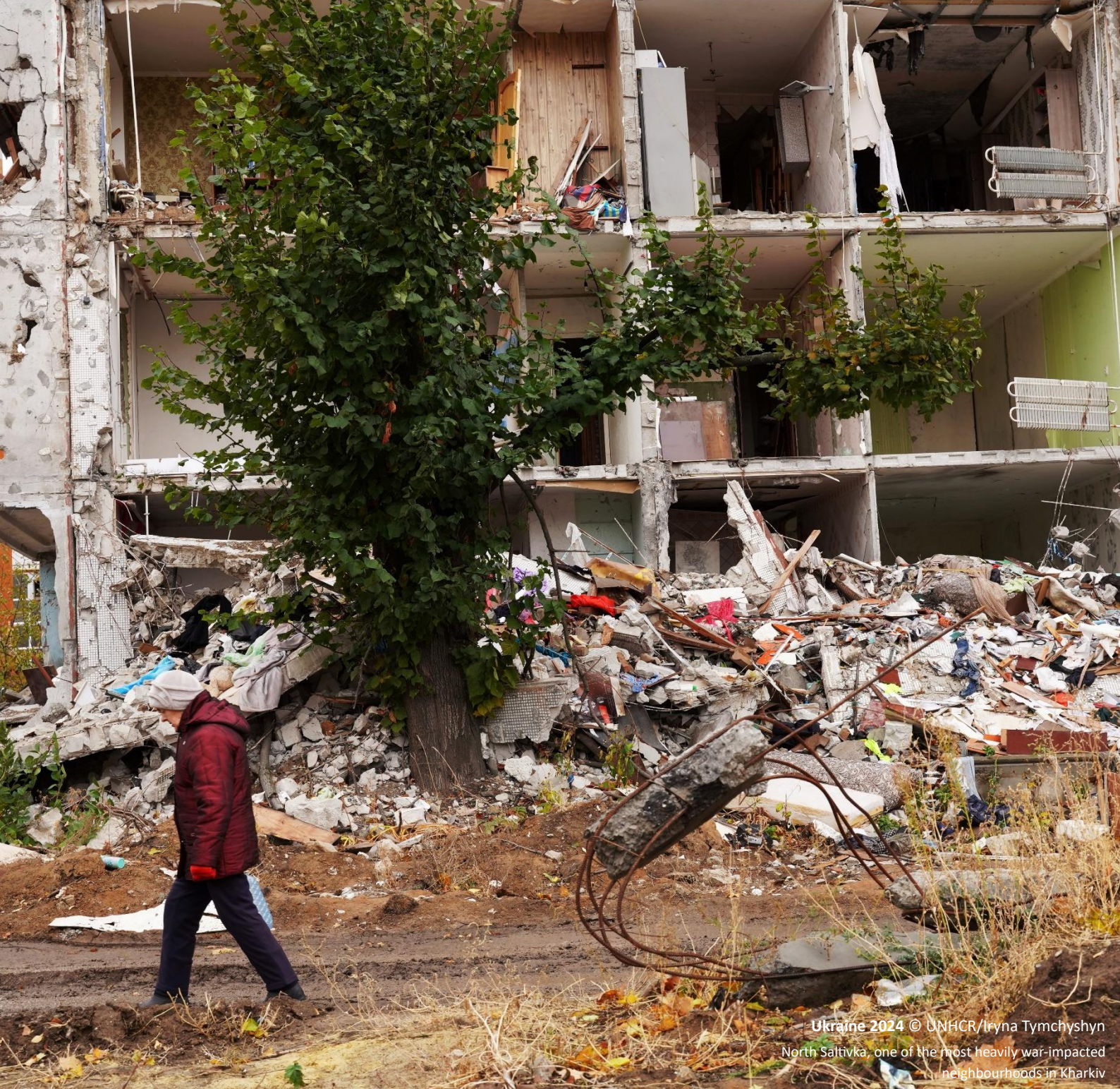
Ukraine 2024 North Saltivka, one of the most heavily war-impacted neighbourhoods in Kharkiv