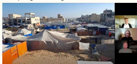
Global Protection Forum

Collaboration with other clusters continued with the aim of better integration of HLP-sensitive approaches into programming across sectors. The HLP AoR continues to work closely with the CCCM Cluster (hosting and