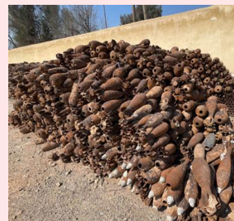
Contamination in Syria