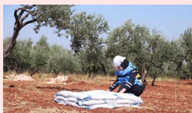
Clearance activities in Syria

In addition, the team worked with the International Rescue Committee to incorporate survivors into existing Project Case Management frameworks by advocating for Mine Action to be included in the new guidance published at the end of 2024.