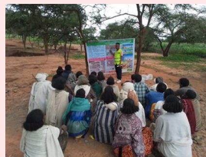
EORE in Ethiopias

Throughout the year, the MA AoR co-coordinators have advocated for risk education efforts to be stepped up across all aspects of the humanitarian response and actively participated in the IOM-GICHD roundtable on displacement, migration and Explosive Ordnance Risk Education (EORE). The MA AoR also hosted an EORE educational hour webinar in October, organised by GICHD, called " Coordinating Risk Education in Emergencies: Better, Faster, Stronger. " This session explored key tools developed by AoR coordinators to minimise gaps and duplications in EORE coverage. The webinar also highlighted the collaboration between the MA AoR and IOM's Displacement Tracking Matrix, along with insights into the Mine Action Field Companion.