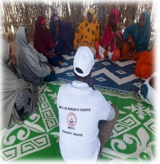
Figure 3 . FGD targeting elderly women conducted by MRDO in Jowhar