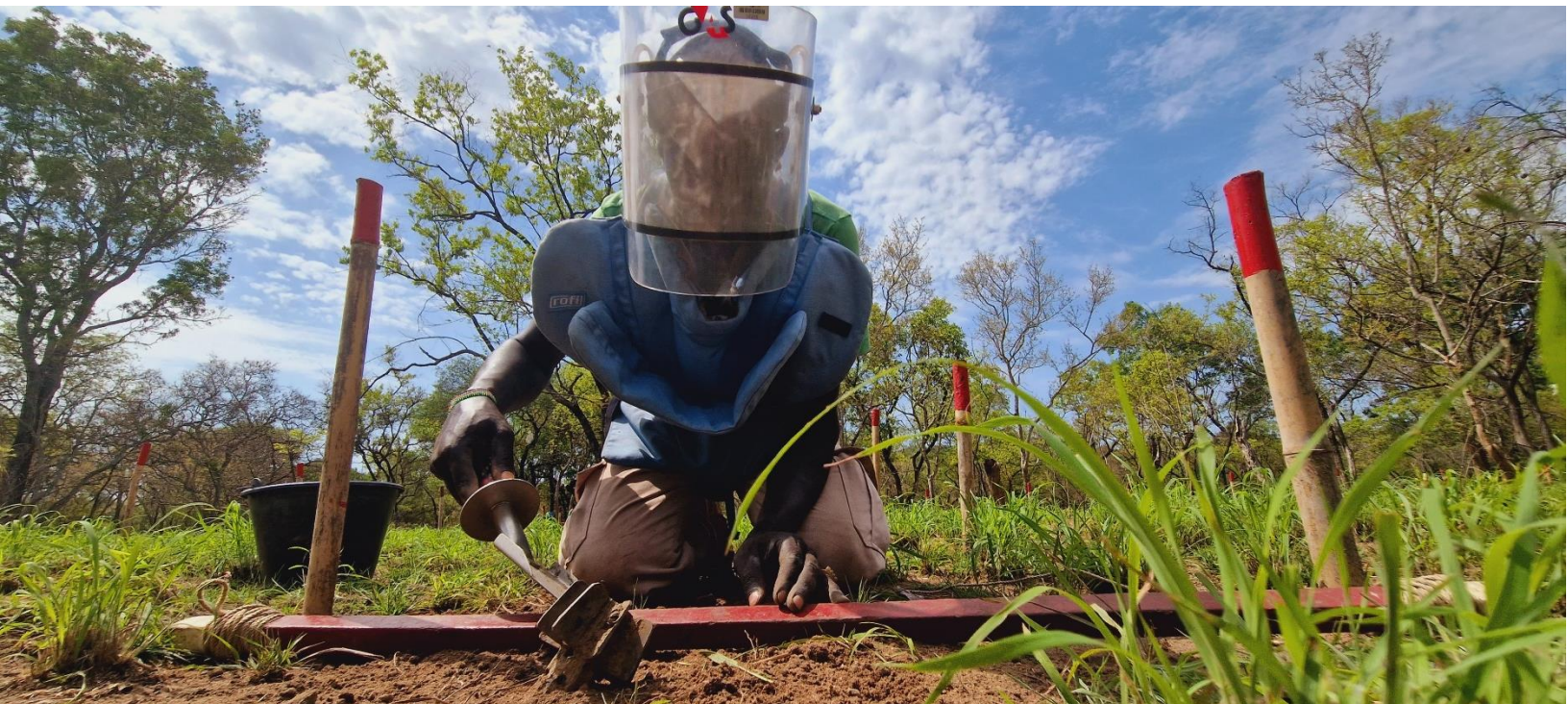
Sam Mednick/Mine Action conducts land clearance on a task site in Ameer Junction in Magwi County

USAID South Sudan is backing a stakeholder-driven project to enhance collaboration and communication among protection service providers. Following initial talks, USAID will support certain activities of the Protection Cluster, targeting the initiative's objectives. The cluster is now completing its 2024 action plan.