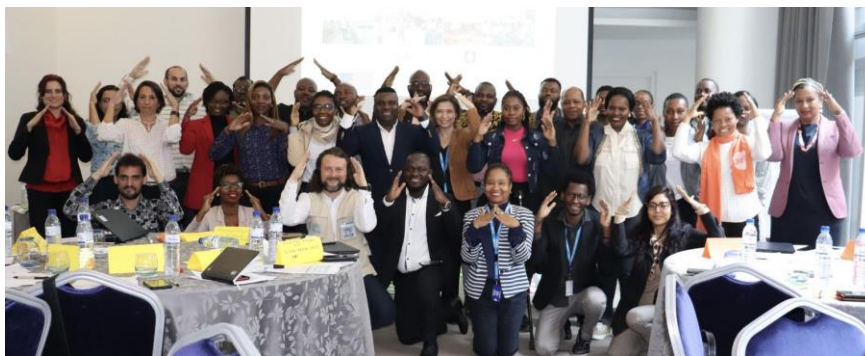
The workshop was an opportunity to reflect on the past Rainy Season 2022/23 in which Cyclone Freddy made two landfalls on Mozambique territory and impacted over 1 Million individuals. The event gathered Government partners, UN Agencies and national and international non governmental organizations (NGOs).

Improve Coordination between authorities and partners as well as between protection actors.