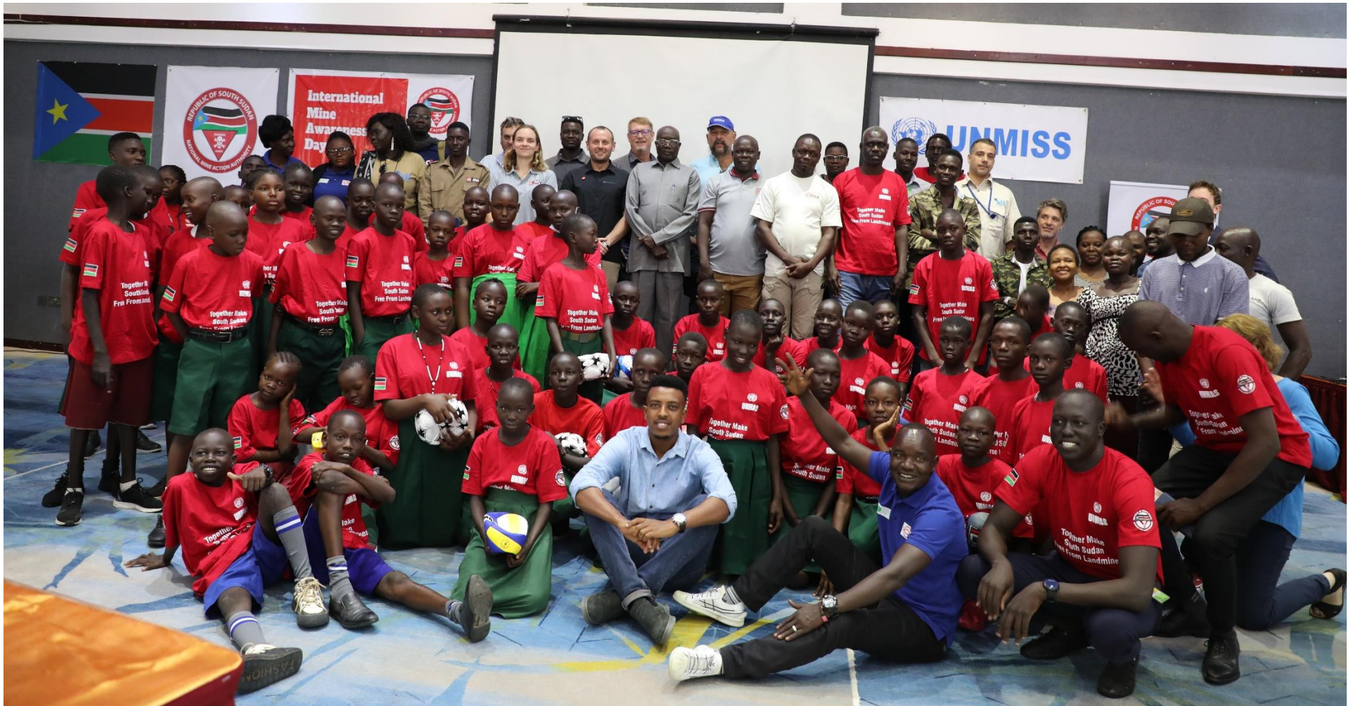
Mine Action partners marked the International Mine Awareness and Mine Action Day in Juba on 4th April

On 15 April 2023, fighting erupted in Khartoum and other regions of Sudan. Thousands of people fled their homes, seeking refuge and protection in neighboring countries. Since April 16, South Sudan has received thousands of new arrivals (mostly South Sudanese returnees) through several entry points along the border between Sudan and South Sudan. Over 90% of those are passing through the Joda border point in Renk County, Upper Nile State, with an influx of close to 35,000 newly arrived people by the end of the month. UNHCR and IOM are working closely with the authorities and partners responding to the situation, including the registration of the new arrival at the various data points. The data can be found on Population movement dashboard . The Protection Cluster works closely with the inter-agency response team on the ground to provide support.