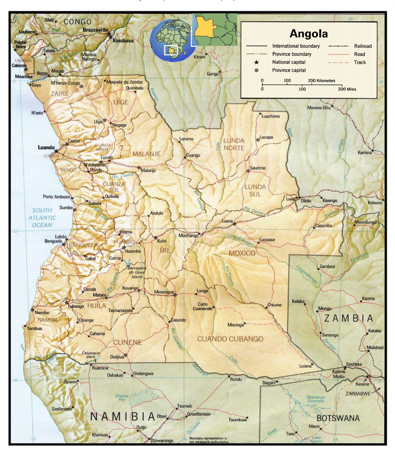
Fig. 1. Administrative map of Angola.

to the local population. The Angolan state had a very limited presence in the areas of resettlement, and the Angolan justice system was among the weakest institutions of the postwar government (Cain, in press). While the role of customary authorities in land matters had disintegrated significantly during the colonial rule and years of war, the return and resettlement of close to four million people provided a restored role for the customary leadership in attempting to manage