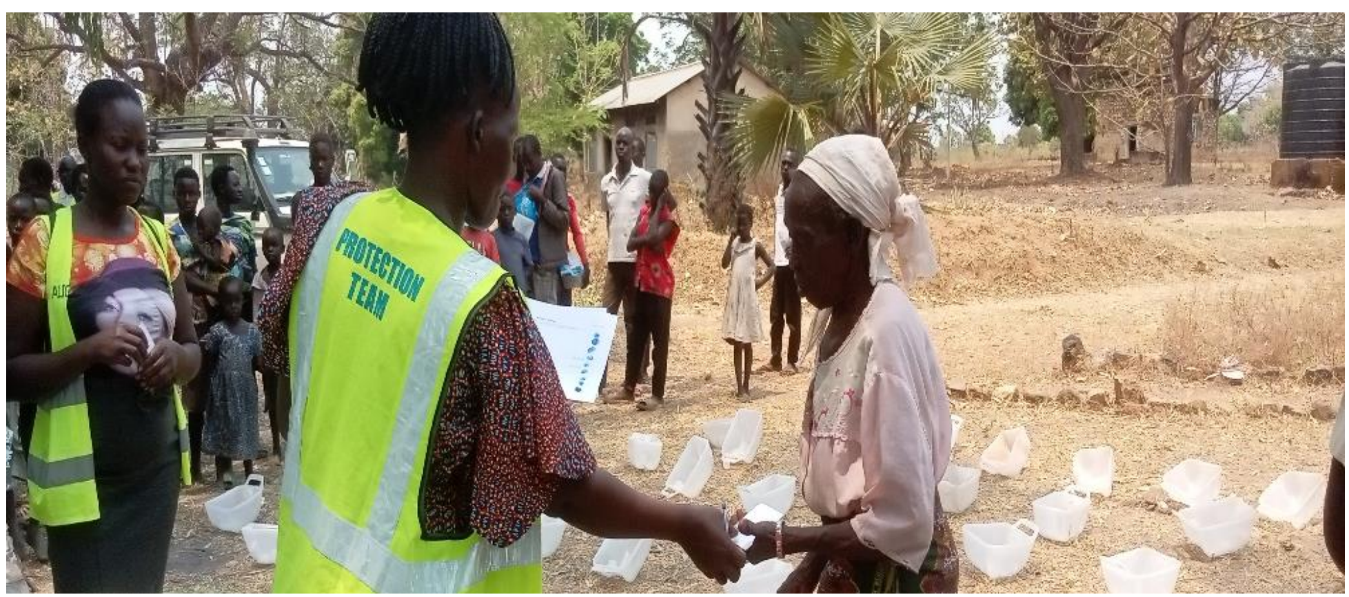
Protection Cluster members assisting displaced people in Kajo-keji

Protection Monitoring System: In February 2023, field monitors who attended the PROMO noted an increase in the lack of security and safety by 15% - compared to January 2023. Similarly, rises in child protection issues such as child marriages (15%), recruitment (22%), and family separations (16%) were also highlighted, as well as conflict related GBV which was flagged by more than 60% of key informants. It is Important to note the analysis developed in the PROMO meeting is used to inform the Needs Assessment Working Group (NAWG) severity ranking.