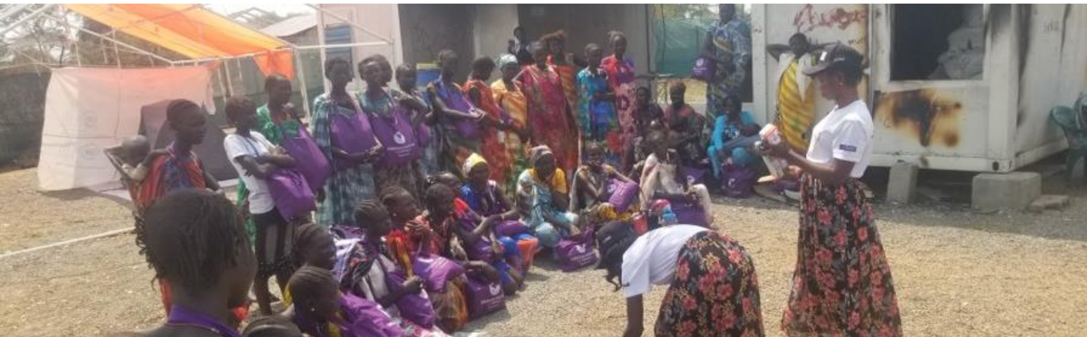
GBV AoR: Demonstration of the use of dignity kits to women

Protection Cluster developed draft HCT Protection strategy: HCT Protection Strategy was developed to give effect to the IASC Principals' Centrality of Protection Statement (2013), the IASC Protection Policy (2016) and the IASC terms of reference for HCTs (2017), which stipulates the collective approach toward the centrality of protection and the development and implementation of the ensuing HCT Protection Strategy as a mandatory priority of an HCT.