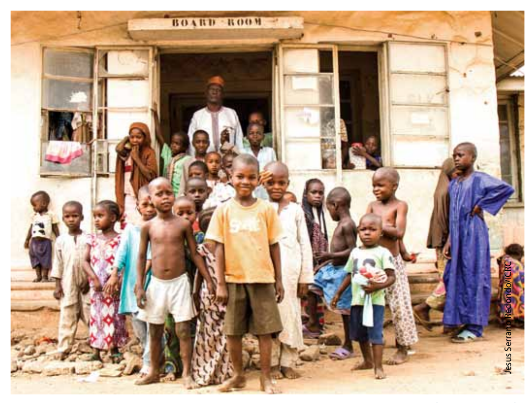
Adamawa State, Yola. Children are among the most vulnerable IDPs affected by the conflict.

Acknowledging that States experiencing crisis may sometimes require support and resources from other actors, the Convention outlines the obligations of other stakeholders, such as the African Union<sup>34</sup> and humanitarian organisations, including the obligation to operate in accordance with the principles of humanity, neutrality, impartiality and independence.<sup>35</sup> In particular, the Convention recognises the specific mandate of the ICRC to protect and assist persons affected by armed conflict and other situations of violence, as well as the specific roles of international organisations and agencies, including the protection expertise of the United Nations High Commissioner for Refugees (UNHCR).<sup>36</sup> In addressing the roles and obligations of other stakeholders, the Convention also imposes obligations on non-state armed groups.<sup>37</sup>