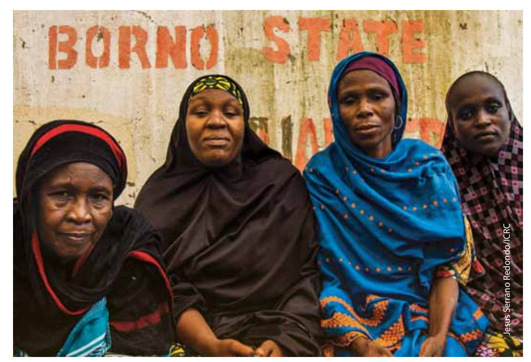
Borno State, Maiduguri. Widows who have lost their husbands as a result of the armed conflict are registered with the Christian and Muslim Widows Association in Maiduguri, Borno State.

Recommendation 28 : National authorities and humanitarian actors must ensure that collection and use of personal data of IDPs is in compliance with Nigerian and regional laws, including the Nigerian Constitution and the Supplementary Act on Personal Data Protection within the ECOWAS (2010), as well as international law and standards. In particular, personal data should be treated in accordance with the principles of consent, confidentiality, legality, fairness and security. It should only be obtained for specific, explicit and lawful purposes and should not be further processed in any manner incompatible with such purposes.