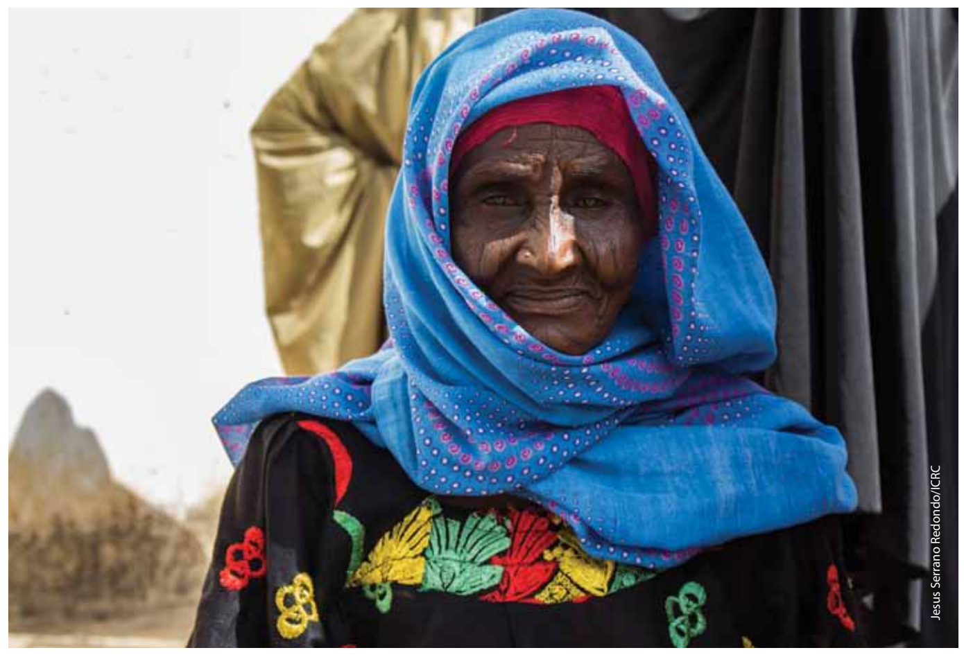
Borno State, Maiduguri. The elderly have been affected by the conflict. Most of them had to walk over mountains for days without food, medicines and water, leaving everything behind to reach safety.