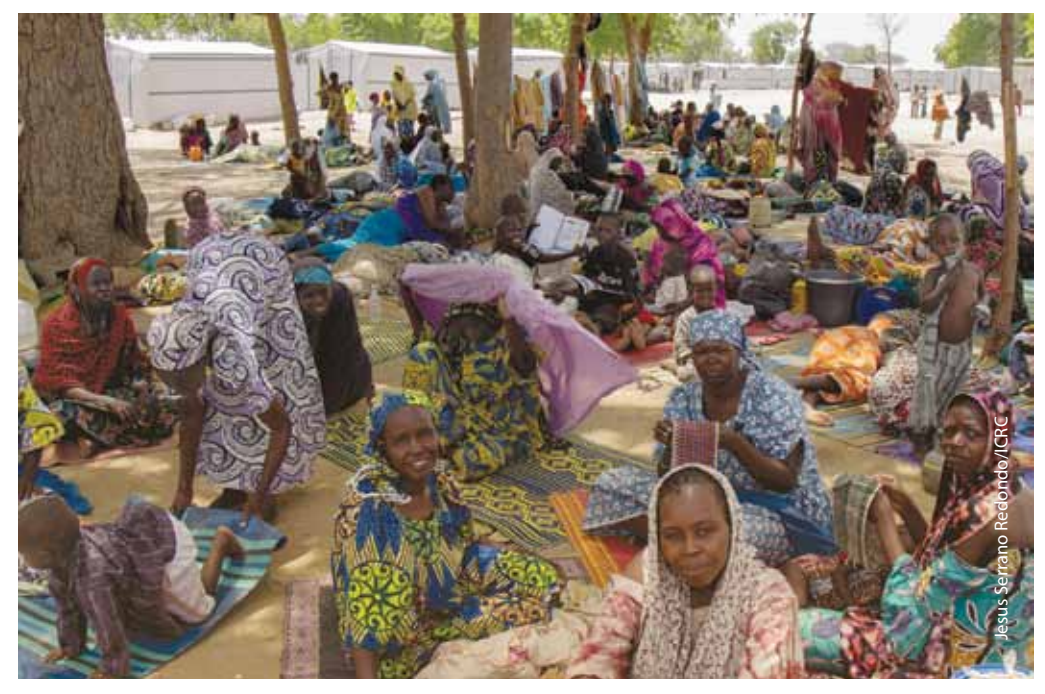
Borno State, Maiduguri. The armed conflict in the North East Nigeria has resulted in thousands of casualties and has forced more than 2 million IDPs to flee their homes.

In light of the critical humanitarian situation, the aim of this report is to assess the situation of IDPs in Borno, Adamawa and Yobe States, through the framework of the Kampala Convention. In doing so, the report seeks to highlight the current gaps and challenges in meeting the needs of IDPs, and provide concrete recommendations to improve protection, assistance and durable solutions for IDPs. The ICRC hopes that the findings and recommendations can serve as a policy tool for the Nigerian Government in its response to conflict-induced internal displacement in the North East of Nigeria. Ultimately, the goal is to achieve better protection and assistance for IDPs through more effective "operationalisation" of the Convention, particularly in Borno, Adamawa and Yobe States.