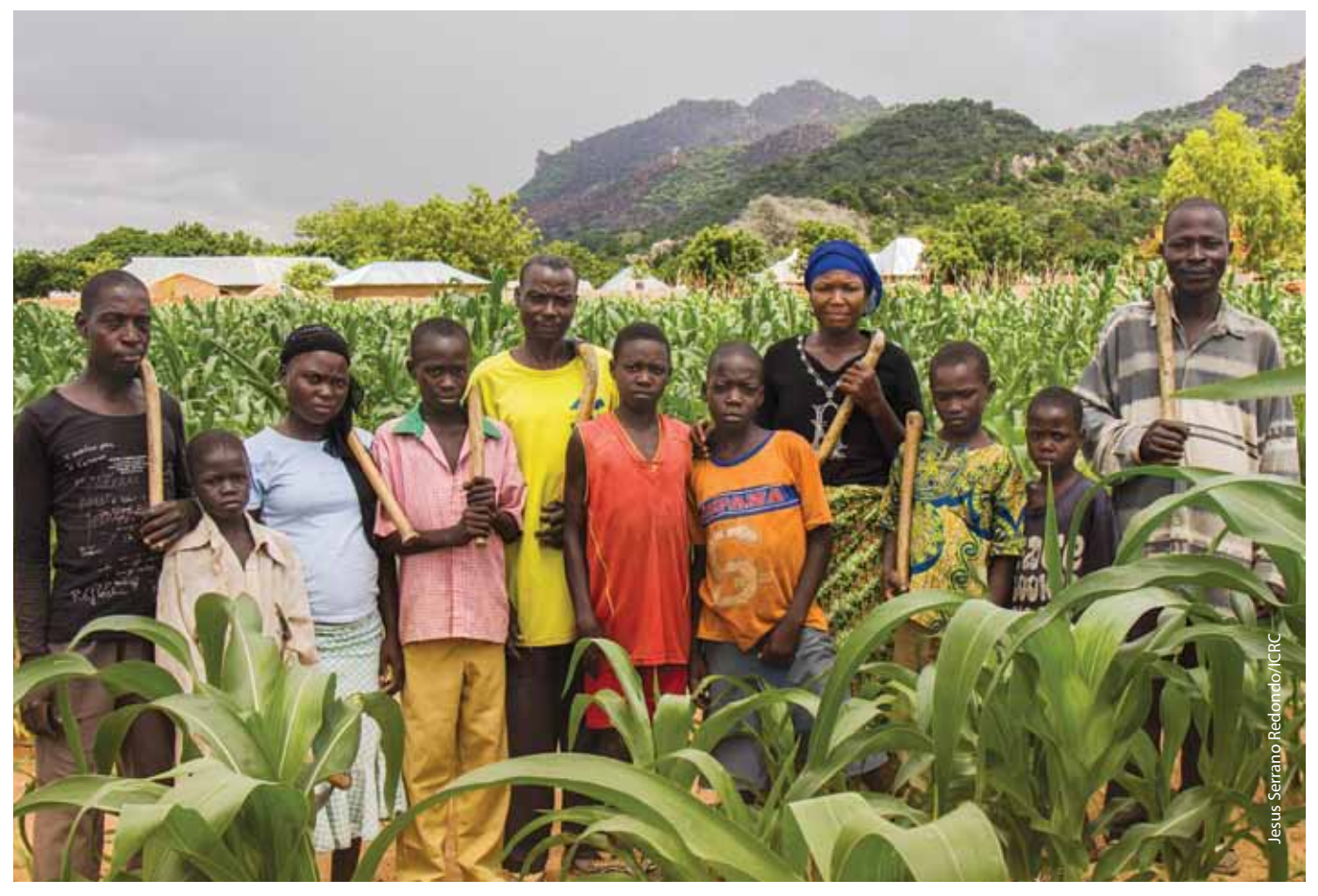
Adamawa State, Mubi. More than 40,000 people, most of them farmers, fled the Mubi area for Cameroon because of the conflict. Many were able to return to their areas of habitual residence in 2015 to recommence farming.