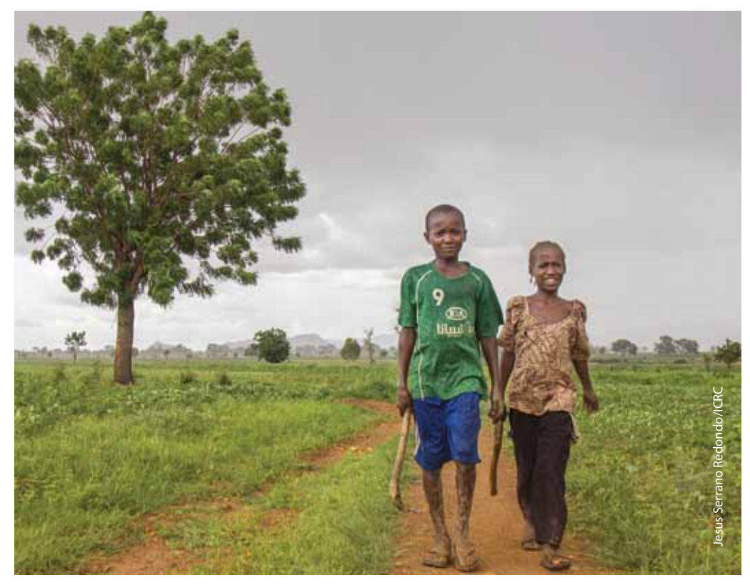
Adamawa State, Mubi. When the conflict reached Mubi at the end of 2014, children were among the more than 40,000 people who fled on foot over 200 km to neighbouring Cameroon, before returning to Mubi in 2015.

Recommendation 41: Existing protection mechanisms, such as the National Human Rights Commission Protection Monitoring Project, should be strengthened and should prioritise efforts to monitor the voluntariness of return.