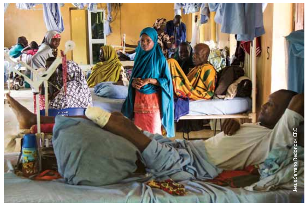
Borno State, Maiduguri. Patients at the Maiduguri State Specialist Hospital, including a 33 year patient from Baga recovering after the amputation of his left leg.

Recommendation 36: Federal authorities should take steps to ensure that timely and simplified procedures exist for importing humanitarian relief items and obtaining visas for international staff of humanitarian organisations; and that such procedures are internally communicated and implemented at all levels within Nigeria and Nigerian embassies abroad.