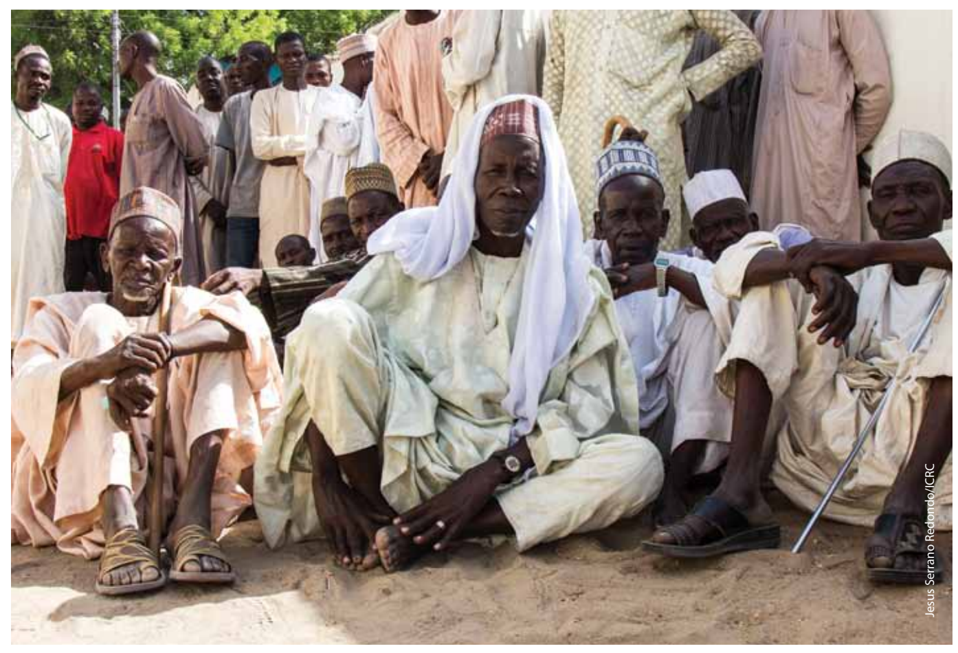
Maiduguri, Borno State. IDPs in an IDP camp during a distribution