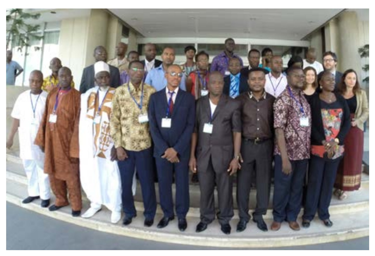
Group photo: Francophone workshop participants

Task Team on Learning of the Global Protection Cluster in October 2012, two Kampala Convention workshops (in Gambia in March 2011 and in Niamey, Niger in November 2012) and three IDP protection training workshops in Mali in March, May and June 2013.