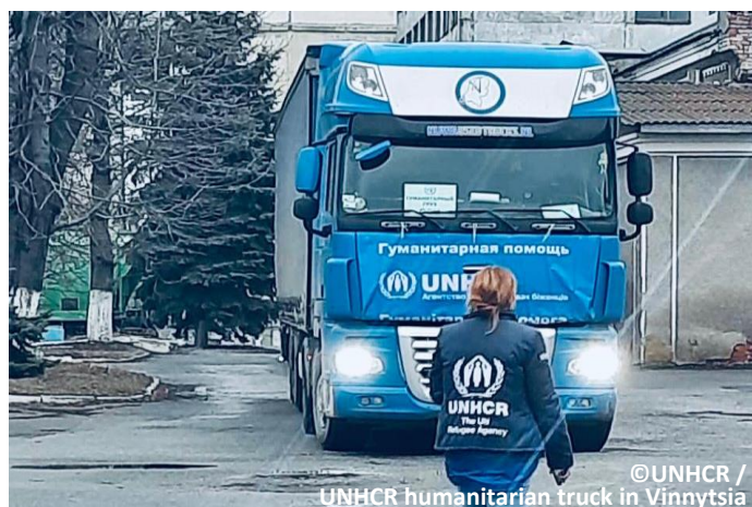
UNHCR humanitarian truck in Vinnytsia