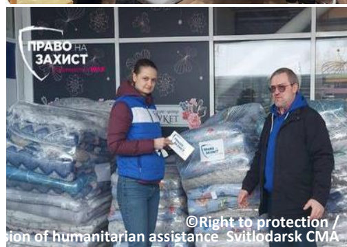
©Right to protection / Provision of humanitarian assistance Svitlodarsk CMA