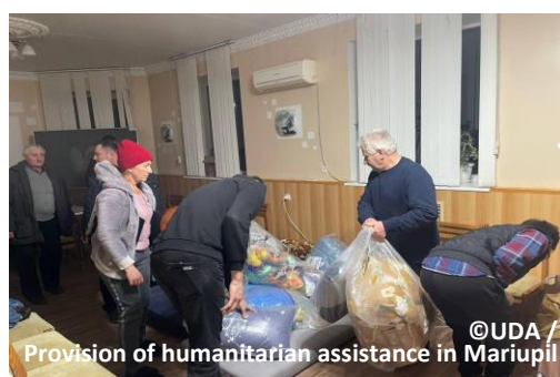
Provision of humanitarian assistance in Mariupol