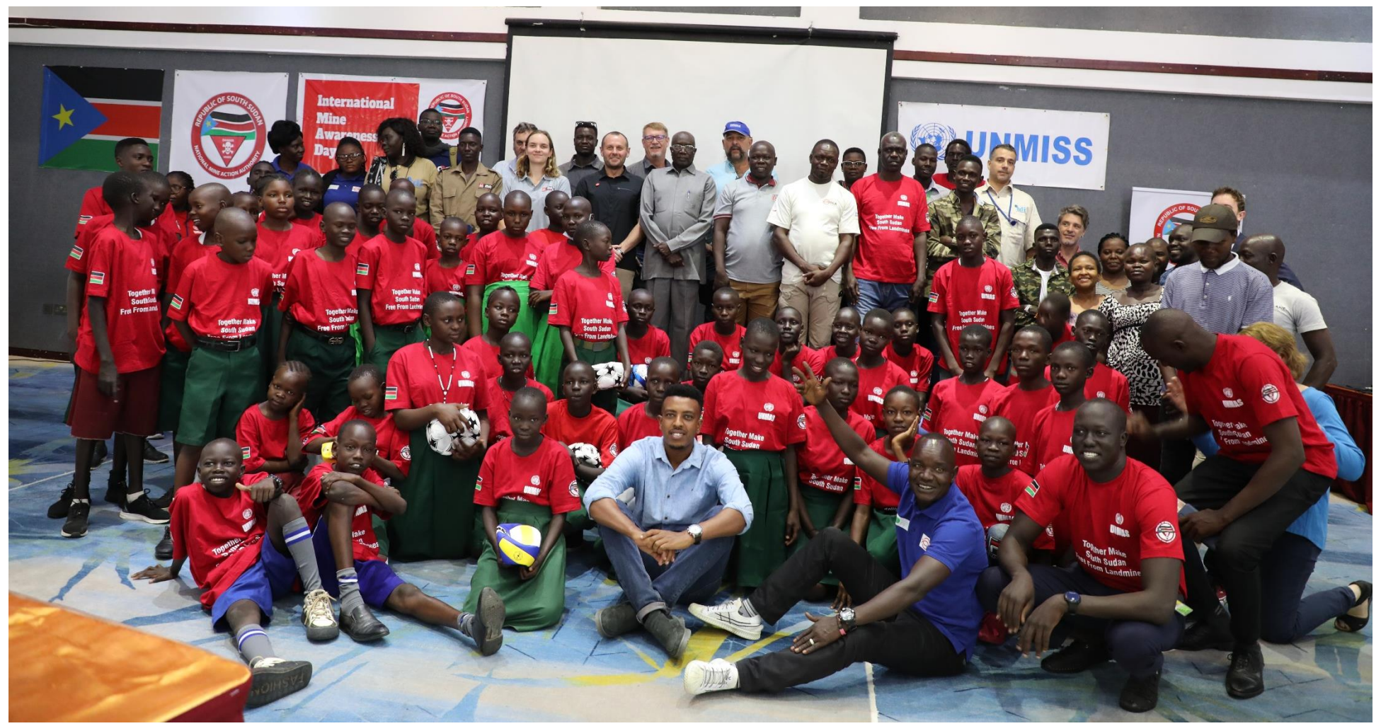
Mine Action partners marked the International Mine Awareness and Mine Action Day in Juba on 4th April

On 15 April 2023, fighting erupted in Khartoum and other regions of Sudan. Thousands of people fled their homes, seeking refuge and protection in neighboring countries. Since April 16, South Sudan has received thousands of new arrivals (mostly South Sudanese returnees) through several entry points along the border between Sudan and South Sudan. Over 90% of those are passing through the Joda border point in Renk County, Upper Nile State, with an influx of close to 35,000 newly arrived people by the end of the month. UNHCR and IOM are working closely with the authorities and partners responding to the situation, including the registration of the new arrival at the various data points. The data can be found on <u>Population movement dashboard</u>. The Protection Cluster works closely with the inter-agency response team on the ground to provide support.