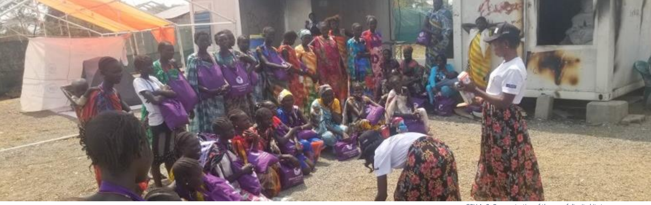
GBV AoR: Demonstration of the use of dignity kits to women

Protection Cluster developed draft HCT Protection strategy: HCT Protection Strategy was developed to give effect to the IASC Principals' Centrality of Protection Statement (2013), the IASC Protection Policy (2016) and the IASC terms of reference for HCTs (2017), which stipulates the collective approach toward the centrality of protection and the development and implementation of the ensuing HCT Protection Strategy as a mandatory priority of an HCT.