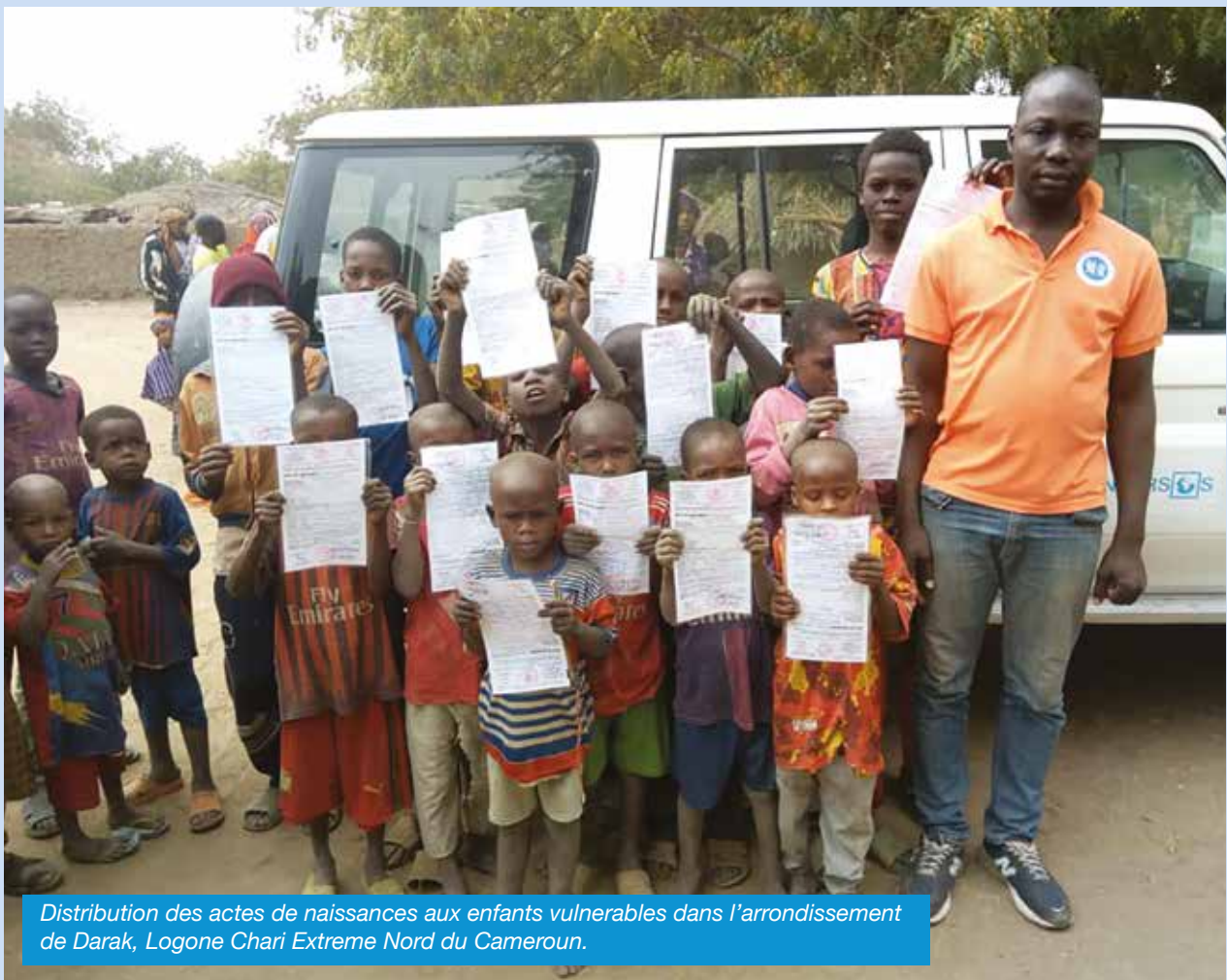
Distribution des actes de naissances aux enfants vulnérables dans l'arrondissement de Darak, Logone Chari Extreme Nord du Cameroun.