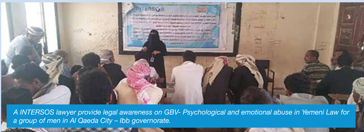
A INTERSONS lawyer provide legal awareness on GBV- Psychological and emotional abuse in Yemeni Law for a group of men in Al Qaeda City – Ibb governorate.