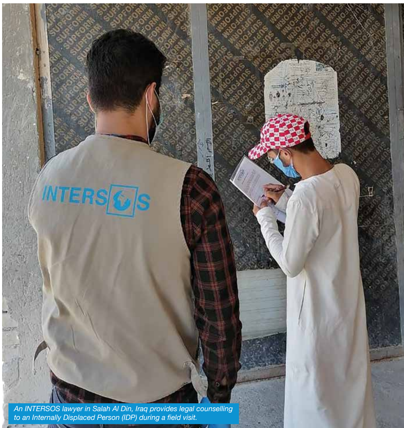
An INTERSOS lawyer in Salah Al Din, Iraq provides legal counselling to an Internally Displaced Person (IDP) during a field visit.