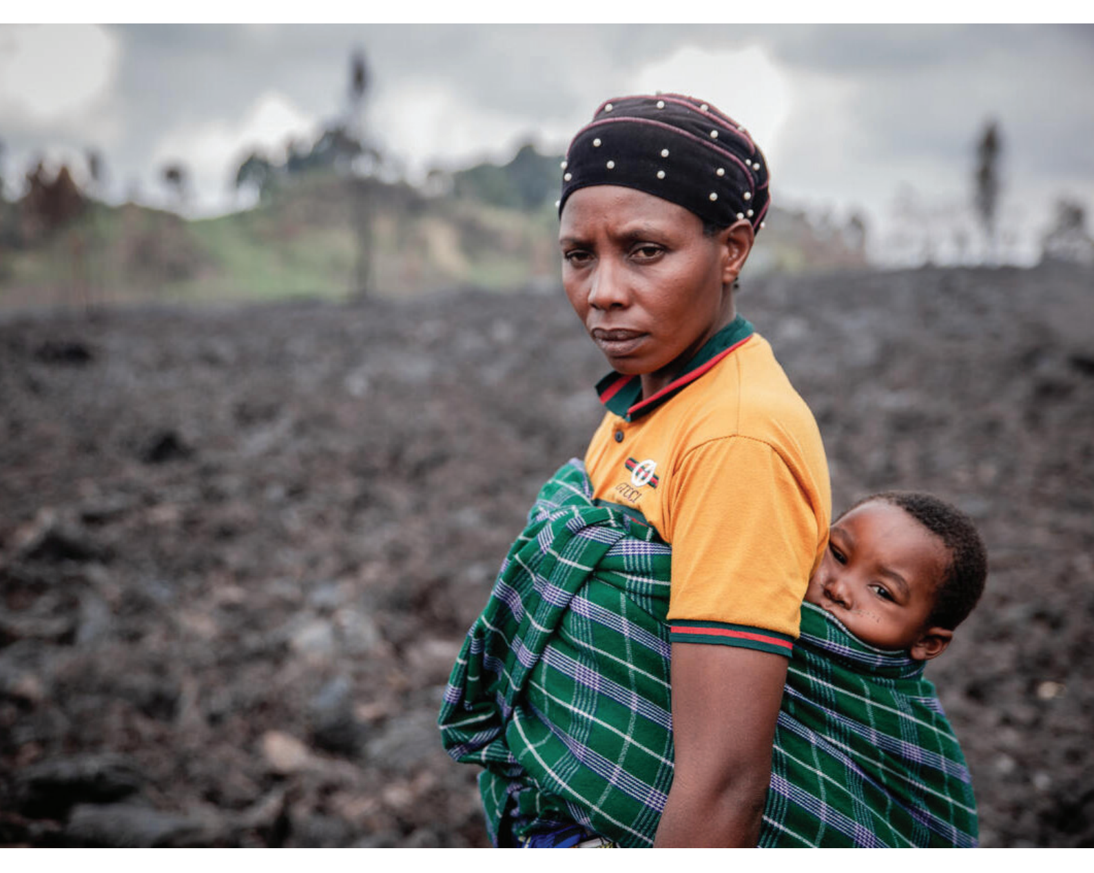
Democratic Republic of Congo: more than 350,000 people were displaced by eruption of the Nyiragongo volcano in Goma. Here an IDP woman, aged 40, visits the spot where their house once stood with one of her 7 children (June 2021).

The Commission has been resolute in continuing to advocate for not just the full implementation of the Decision for the benefit of the Endorois but also for comprehensive legal, policy and institutional reforms to protect the rights of local communities and indigenous people in similar circumstances. This example is illustrative of the need for collaborative, sustained and multi-pronged strategic efforts by communities, civil society and NHRIs to promote and protect the rights of vulnerable citizens, particularly against forced evictions.