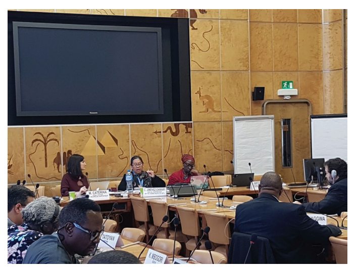
Special Rapporteur on the human rights of IDPs opening the 2018 roundtable with NHRIs

This handbook was developed during the COVID-19 pandemic, which has had a dramatic impact on the mostvulnerable, among them many IDPs. Witnessing this impact has served as a harsh reminder of the importance of a human rights-based approach that prioritizes the respect, promotion, protection and fulfilment of the rights of all, particularly those in vulnerable situations. The fundamental role NHRIs can play has therefore never been clearer.