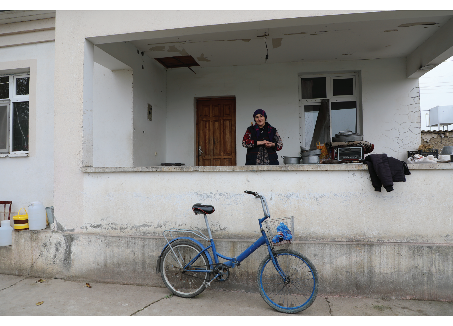
A 51-year-old internally displaced Azerbaijani woman was displaced from Dordyol 1 settlement in the Agdam district, near the disputed territory of Nagorno-Karabakh (2020).

Working with inadequate or inconsistent funding are commonly cited obstacles to the work of NHRIs, hindering their capacity to address the human rights of IDPs. To the extent that it is relevant and feasible, NHRIs' core budget should include specific funding for activities on internal displacement to enable them to address internal displacement through their core and long-term activities, rather than temporary, project-based or one-off funds. While governments should legally ensure adequate funding and guarantee their ability to work independently, NHRIs must often expand their operations using existing resources, with obvious consequences. The institutions' ability to receive external funding, in line with the Paris Principles,<sup>34</sup> is of particular importance, as is the need to work with donors to enhance their understanding of the critical role and value of NHRIs in this area.