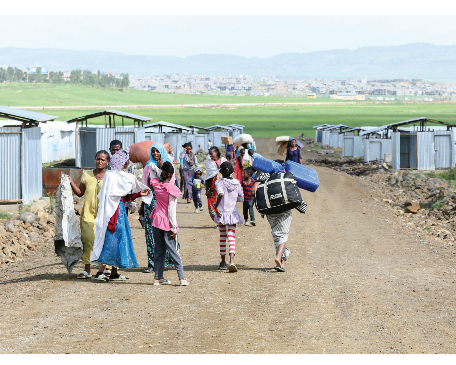
The relocation of internally displaced people to Sabacare 4, a new site constructed to shelter IDPs who cannot return home in Ethiopia (2019).

\rightarrow Watch this video to learn more about the project and ZHRC's role: www.zhrc.org.zw/videos/.