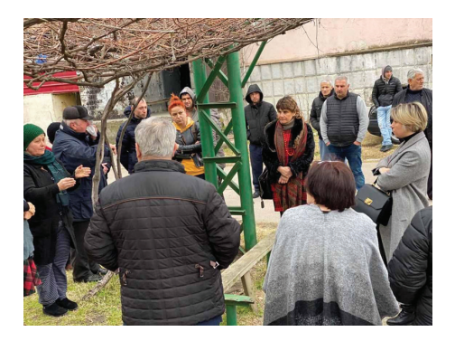
Public Defender meeting with IDPs living in Poti in February 2020.

Physical access to IDPs' former compact settlements has been particularly challenging in the context of the COVID-19 pandemic. The PDO has developed an online monitoring methodology which entailed