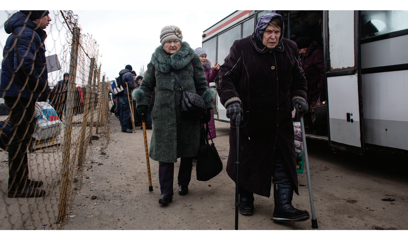
Residents in eastern Ukraine cross the border checkpoint between the government-controlled area and non-government controlled area in Mayorsk, Donetsk (2018).

According to the Ombudsperson, a more predictable and concrete way to protect the rights of IDPs and other affected citizens required legislative changes and consequently, they supported the proposal of a new law, entitled "On amendments to certain laws of Ukraine concerning the exercise of the right to a pension" (no. 2083-d of 26 November 2019) to regulate pension payments to IDPs and persons living in the temporarily occupied territories of Ukraine.