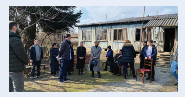
Public Defender visit to IDPs in Shamgona Village

The Georgian PDO, established in 1996, has developed a strong expertise in promoting and protecting the human rights of IDPs from conflict-affected areas. It receives and investigates large numbers of complaints related to internal displacement. Regional representatives of the Georgian PDO actively monitor the situation with respect to IDPs in the former IDP settlements and provide legal assistance to them. PDO representatives provide information about the challenges identified during the visits within the scope of their competence and cooperate with the local government to address these challenges. The Georgian PDO also dedicates a specific chapter of its annual parliamentary report to IDP rights.