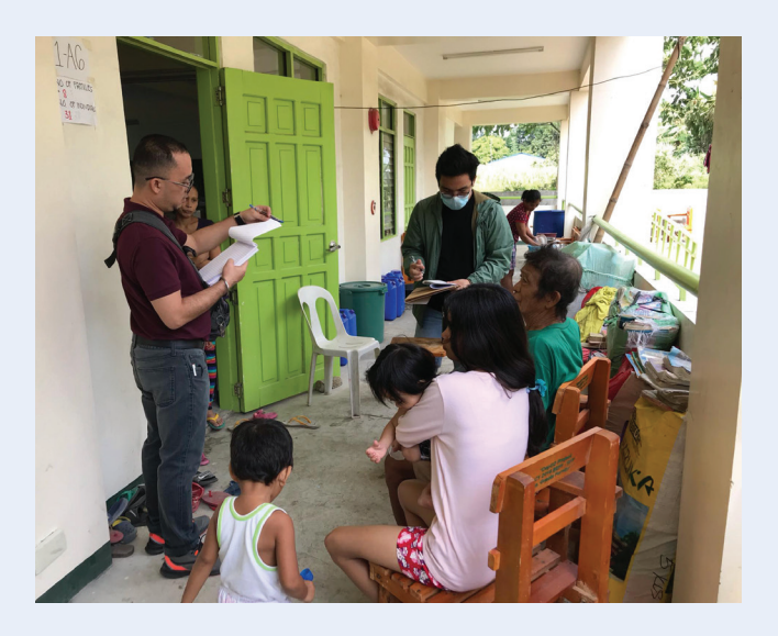
Interviews with IDP families affected by the Taal Volcano eruption in an evacuation site in Balayan, Batangas, February 2020

The tool was designed to help the user to comprehensively describe the situation of IDPs and better document the human rights and humanitarian