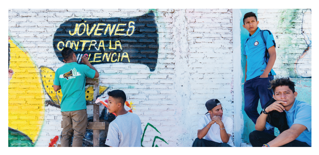
Leaders and volunteers of the organization 'Youth Against Violence' in Colonia Nueva Capital, Tegucigalpa, Honduras. The organization works throughout the country to empower youth through peace-building activities. Its founder and director, along with his family, are IDPs.