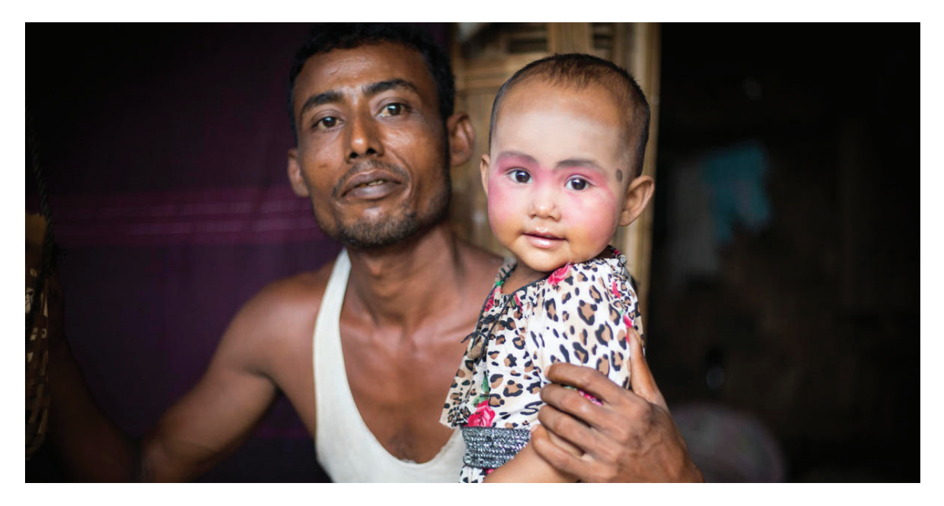
A displaced Rohingya father and his child at Dar Paing camp for internally displaced people in Sittwe, Rakhine state, Myanmar (2017).