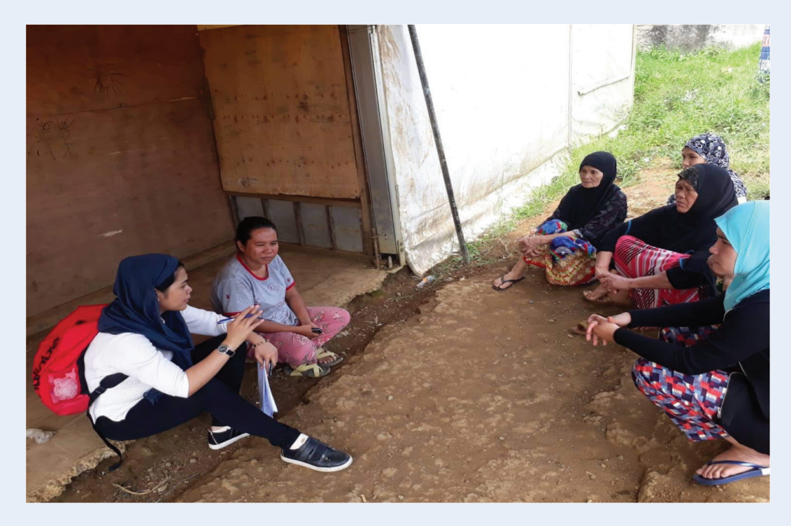
Interview with IDP women leaders in an evacuation site in Marawi City, May 2019

In the Philippines , the Commission on Human Rights established a Regional Office based in the conflict-affected Autonomous Region in Muslim Mindanao (ARMM). The CHR-ARMM Regional Office was a good example of how the decentralization of IDP-related functions, such as IDP monitoring, can be particularly useful in instances where a region of the country merits more intensive IDP protection work than others.