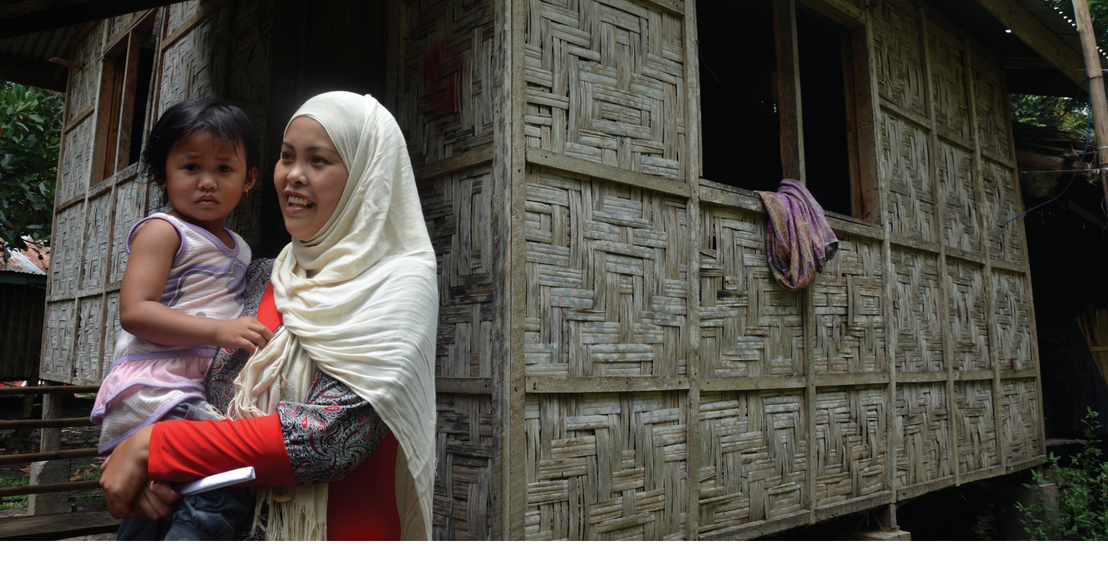
A displaced woman with her child in Madiya, Philippines (2017).