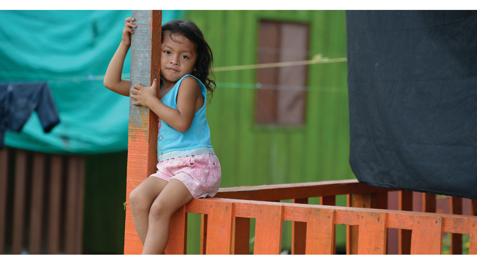
A five-year-old child plays outside her family home at a settlement for displaced people in Caqueta, Colombia (2013).