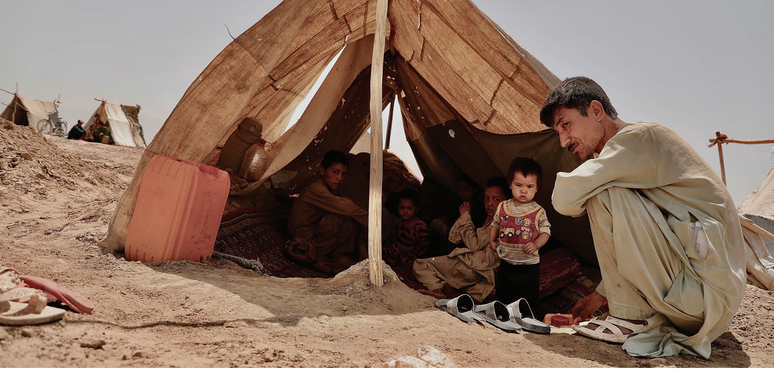
Families displaced by the conflict in Afghanistan are forced to live in makeshift tents in the Bricade settlement (2021).