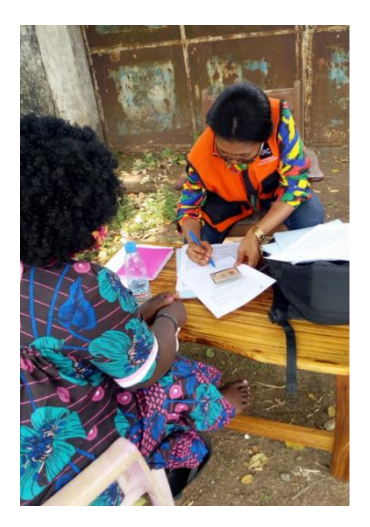
Figure 1Awareness raising on GBV and Human rights in Fako